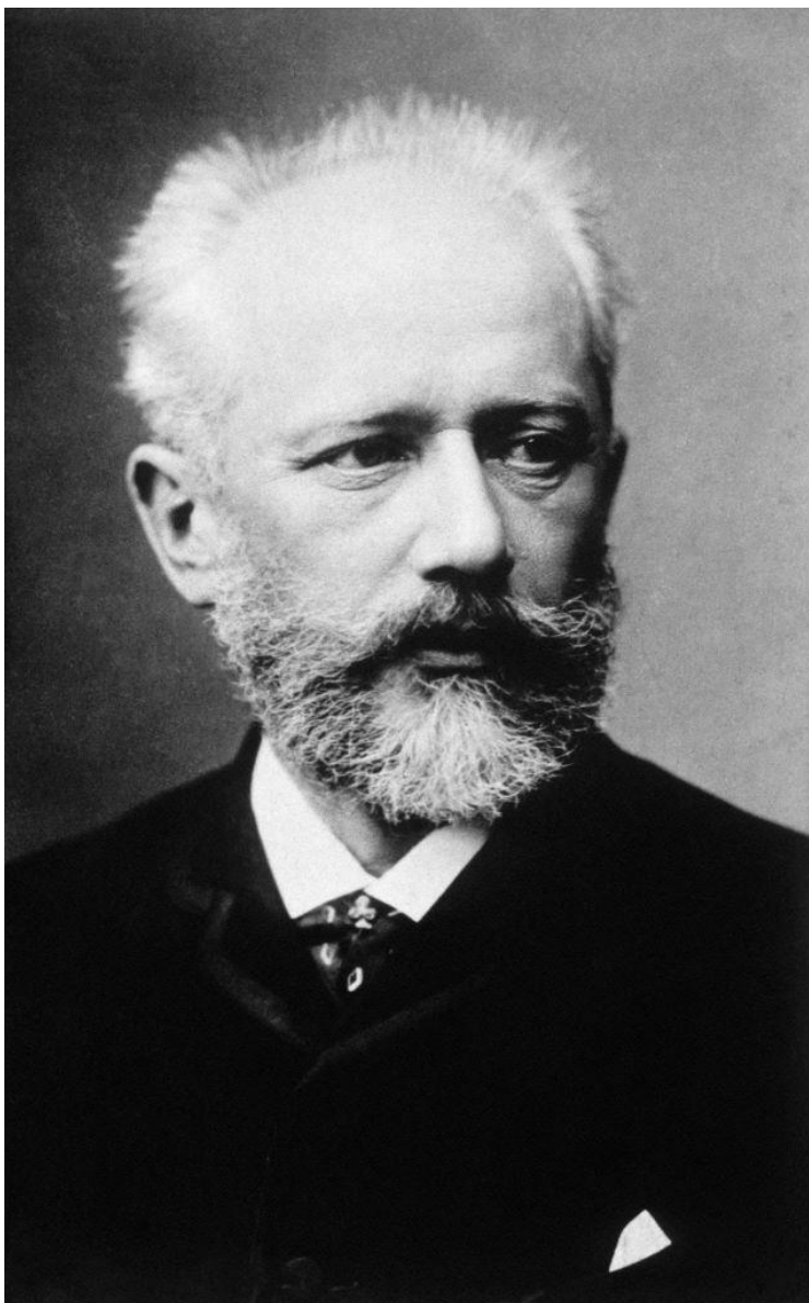
Pyotr Ilyich Tchaikovsky