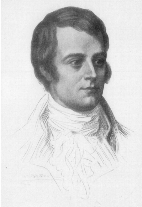
Burns (1759 – 1796)