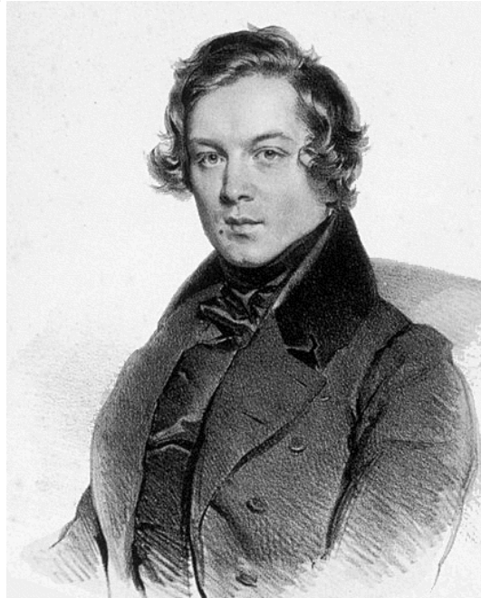
Schumann (1810 – 1856)