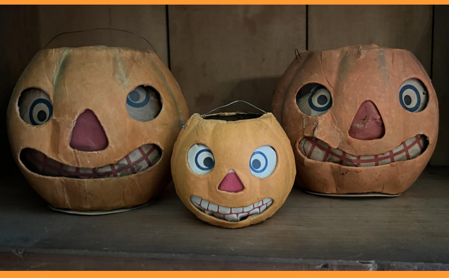
Early German cardboard pumpkins from the 1920s.

After the use of carving real fruits and vegetables, Germany began to import cardboard paper mâché pumpkins in the 1920s in various styles and shapes. Some manufacturers even