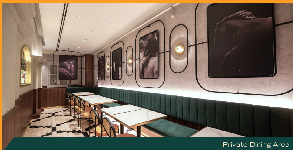
Private Dining Area