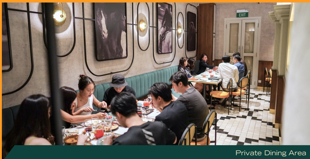
Private Dining Area