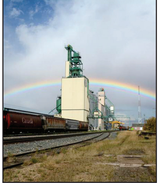
Battle River Railway