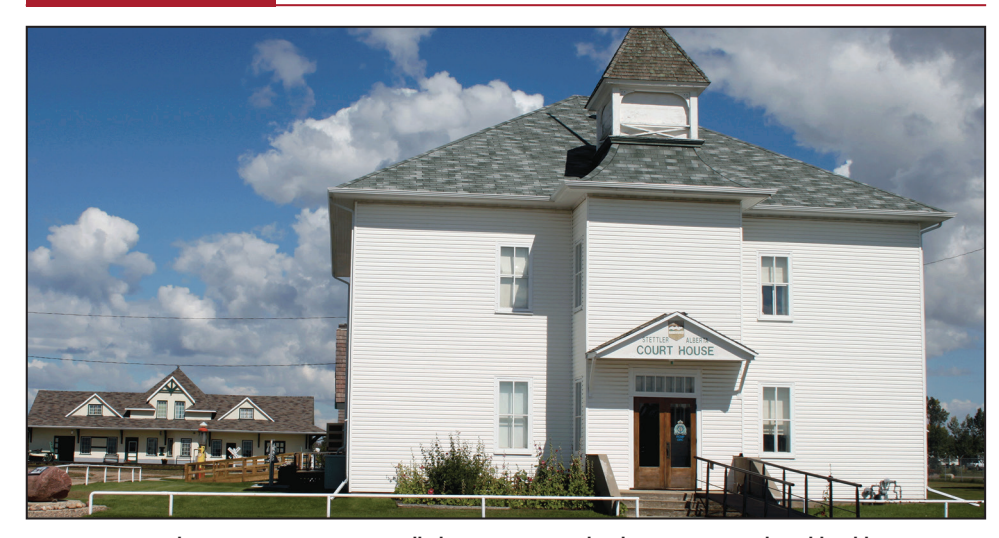
Opportunity Development Cooperatives are all about investing in local economic growth and local businesses.

As a for-profit, an ODC approaches, or is approached by, local entrepreneurs with a business opportunity in need of investment.