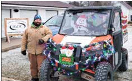
Table Grove Community Improvement Club raised $655 and donated several toys to local VIT kids on their recent SXS ride. A chilli cook-off was also held that day to raise donations.