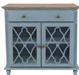
Jofran Two Door Grey Cabinet $370

RED DOT SPECIAL BUY ONE LAMP, at regular price GET 2ND FREE!