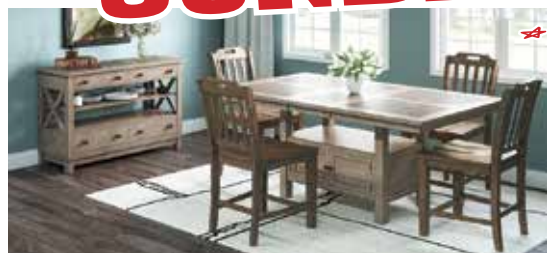
Jofran Pub Tile Top Table with Storage & 4 Chairs.....$1630

Jofran Oak Drop Down Table w/2 chairs..... $720