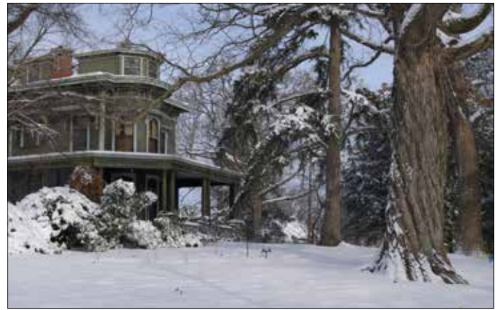
Aldo Leopold's childhood home

The mission of Prairie Land Conservancy is to protect wildlife habitat, open spaces, natural areas, and sustainable agriculture within west Central Illinois. PLC is a Land Trust Alliance accredited conservation land trust and a division of Prairie Hills Resource Conservation and Development. With over 2,400 acres of land in our care, we work every day to protect, restore, and enhance woodlands, prairies, and wetlands for future generations to enjoy.