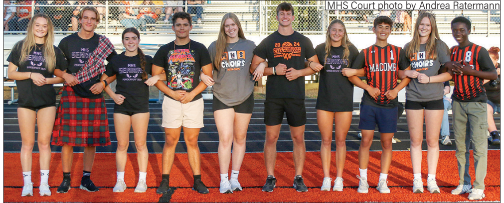
MHS Court