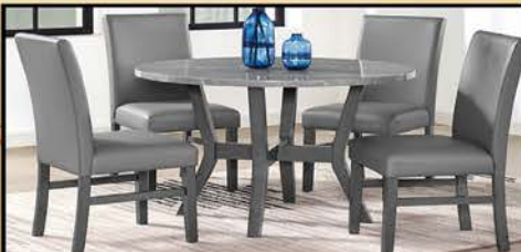
SHANNON GREY 5PC TABLE SET $499