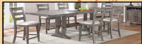
LOIS GREY PUB 7PC SET $1,399