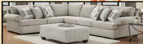
MALLORY ASH SECTIONAL $1,299