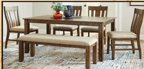
EVERETT 6PC TABLE SET $599