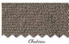
DALY SWIVEL GLIDER RECLINER $999