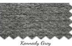
KENNEDY RECLINER $699