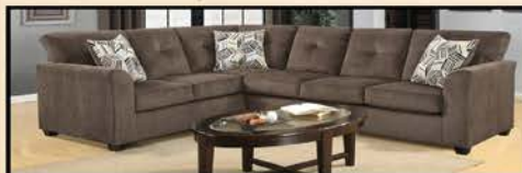
KENNEDY SECTIONAL $1,199