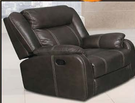
GIN RUMMY CHARCOAL RECLINER $399