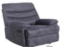
LUCAS OR DAVID RECLINER $499