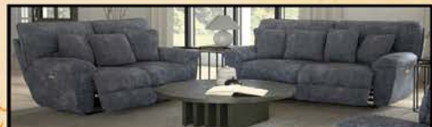
PAXSON SMOKE POWER RECLINING SOFA OR LOVESEAT $1,399 EACH