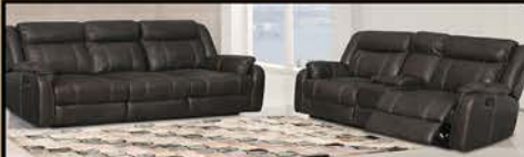
GIN RUMMY CHARCOAL SOFA OR LOVESEAT $699 EACH