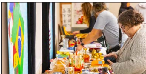
Cultural items from around the world were sold at the International Marketplace to help raise scholarship funds for international education.