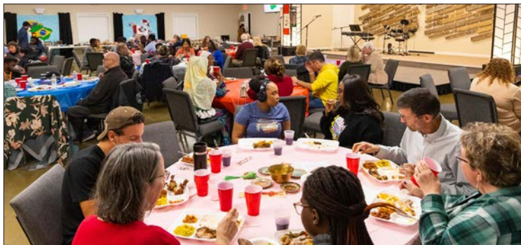
Approximately 80 people enjoyed cuisine from Ghana at the Phi Beta Delta scholarship fundraiser held November 2 at the CSC center.

Membership in Phi Beta Delta is open to WIU faculty, staff and students and members of the greater community interested in international education and exchange of cultures. For application information, please email pbd@wiu.edu .