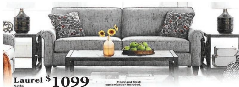
Laurel Sofa $1099

Pillow and finish customization included.