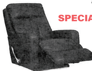
Scarlett High Leg Recliner $999 Leather Match Construction