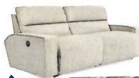
Maddox Reclining Sofa $1299

Pillow and finish customization included.