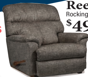
Reed Rocking Recliner $499