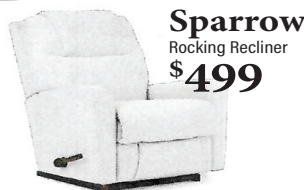
Sparrow Rocking Recliner $499