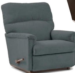
Collage Rocking Recliner $499