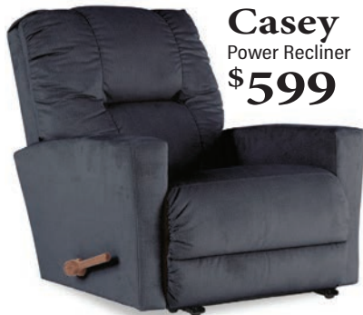
Casey Power Recliner $599