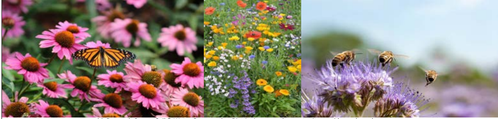
McDonough County Soil & Water Conservation District is an equal opportunity provider & employer

mcdonoughcountyswcd@gmail.com , 309-833-1711 ext. 3