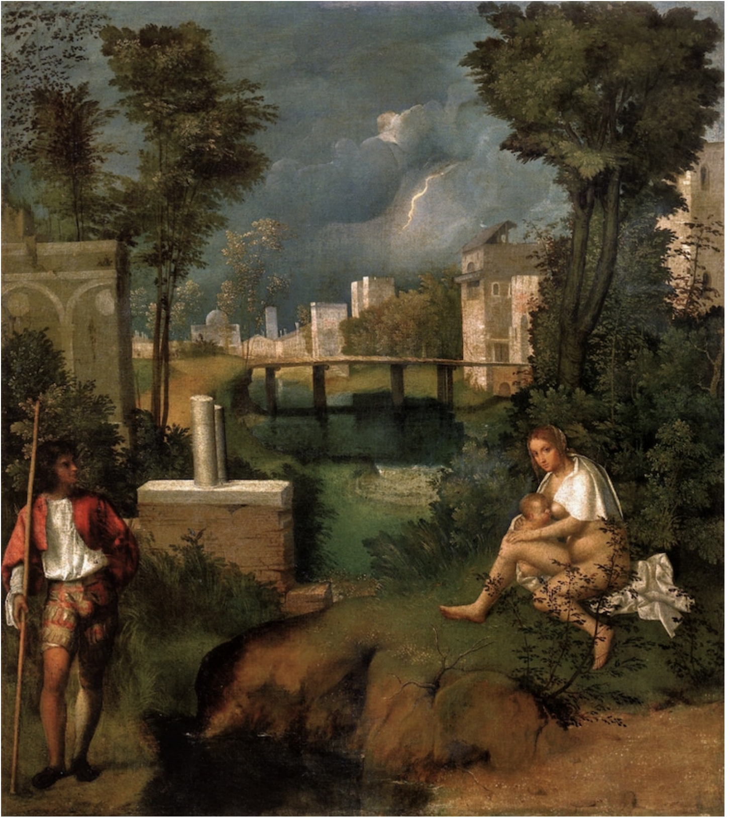
Giorgione, 'The Tempest' (ca. 1506-1508)