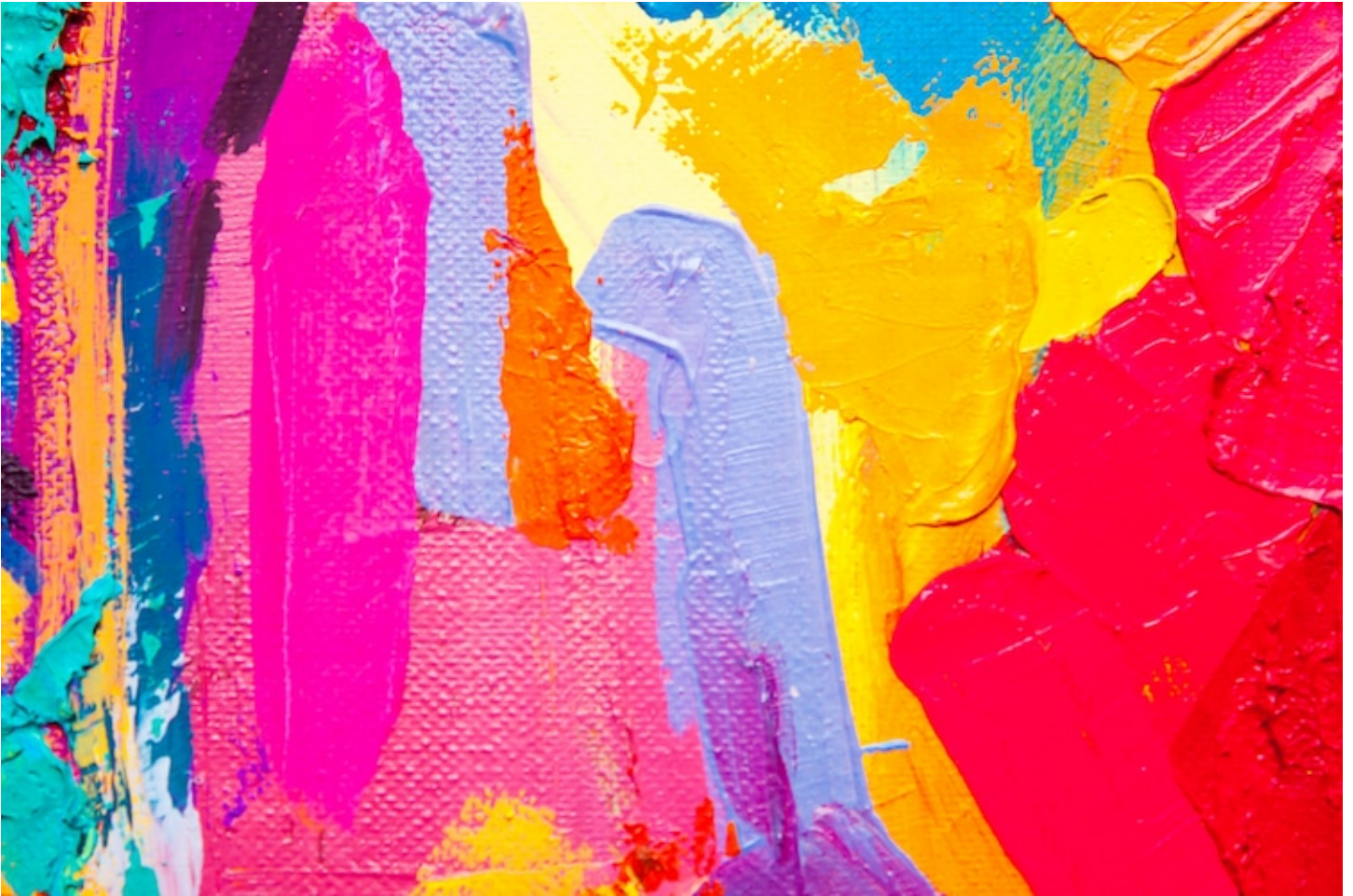
Oil painting on canvas