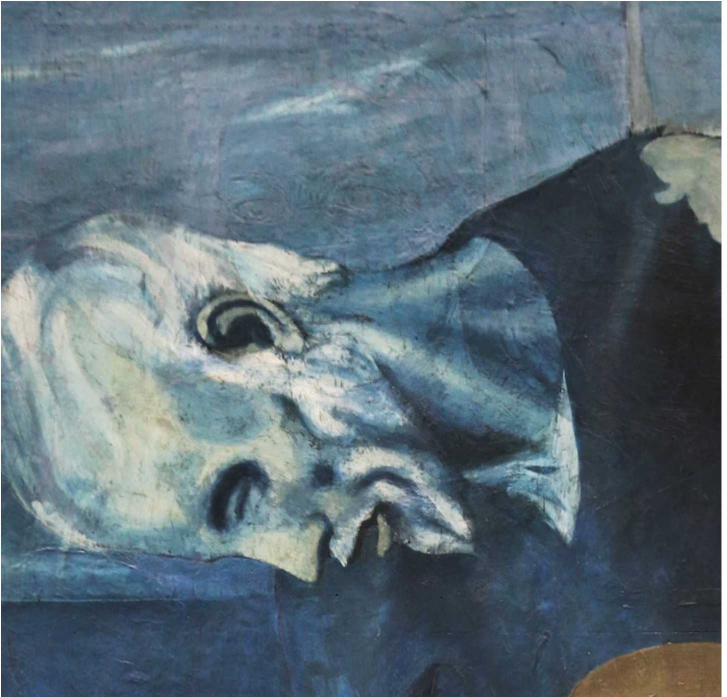
Detail of Picasso, 'The Old Guitarist' (1903)