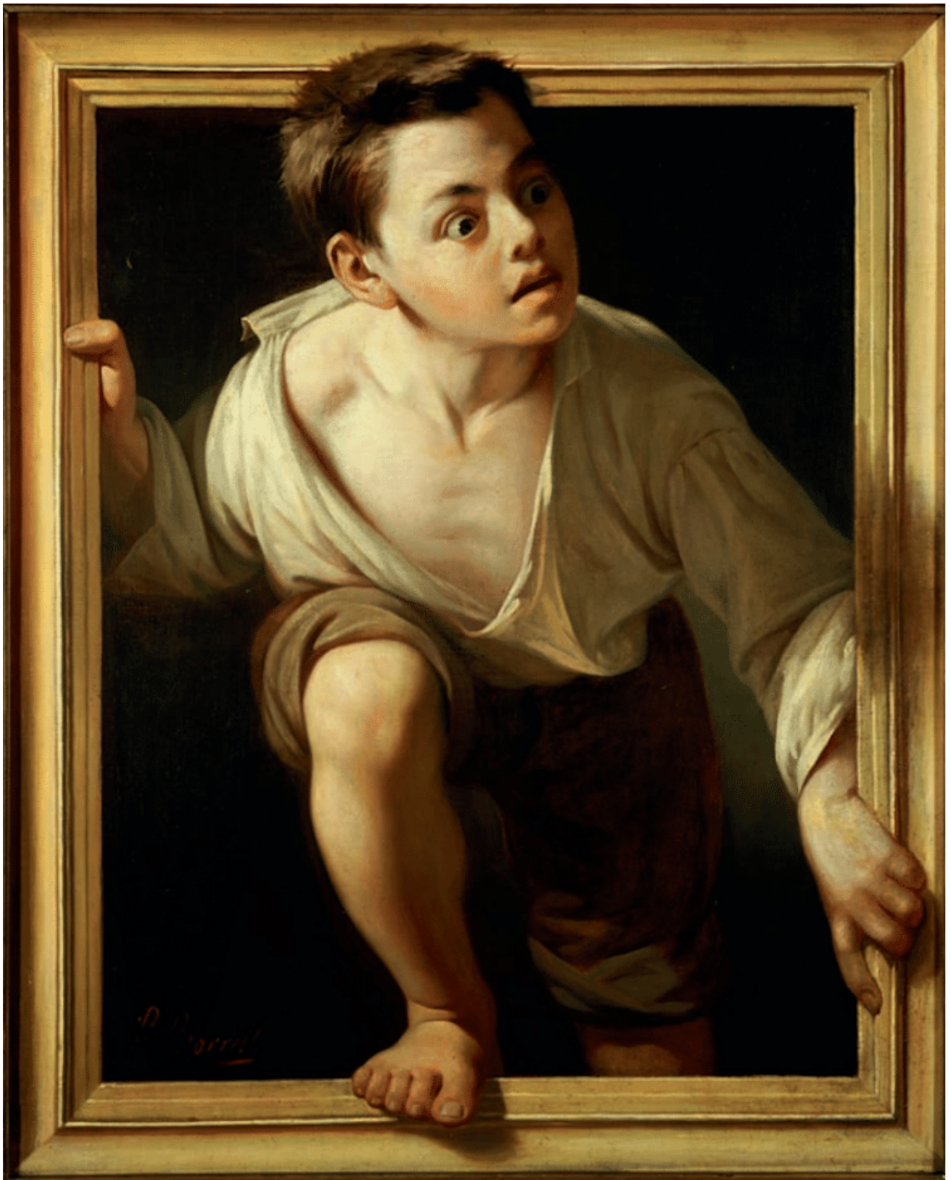
Pere Borrell del Caso, 'Escaping Criticism' (1874)