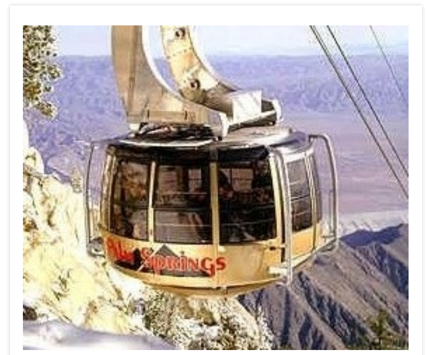
Palm Springs TRAM Tickets!

You have a visual blog, "Interconnections," that you curate. Are these all images of your work?