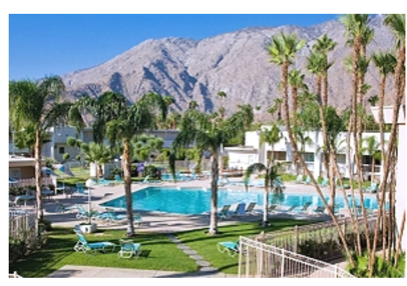
Days Inn Palm Springs!