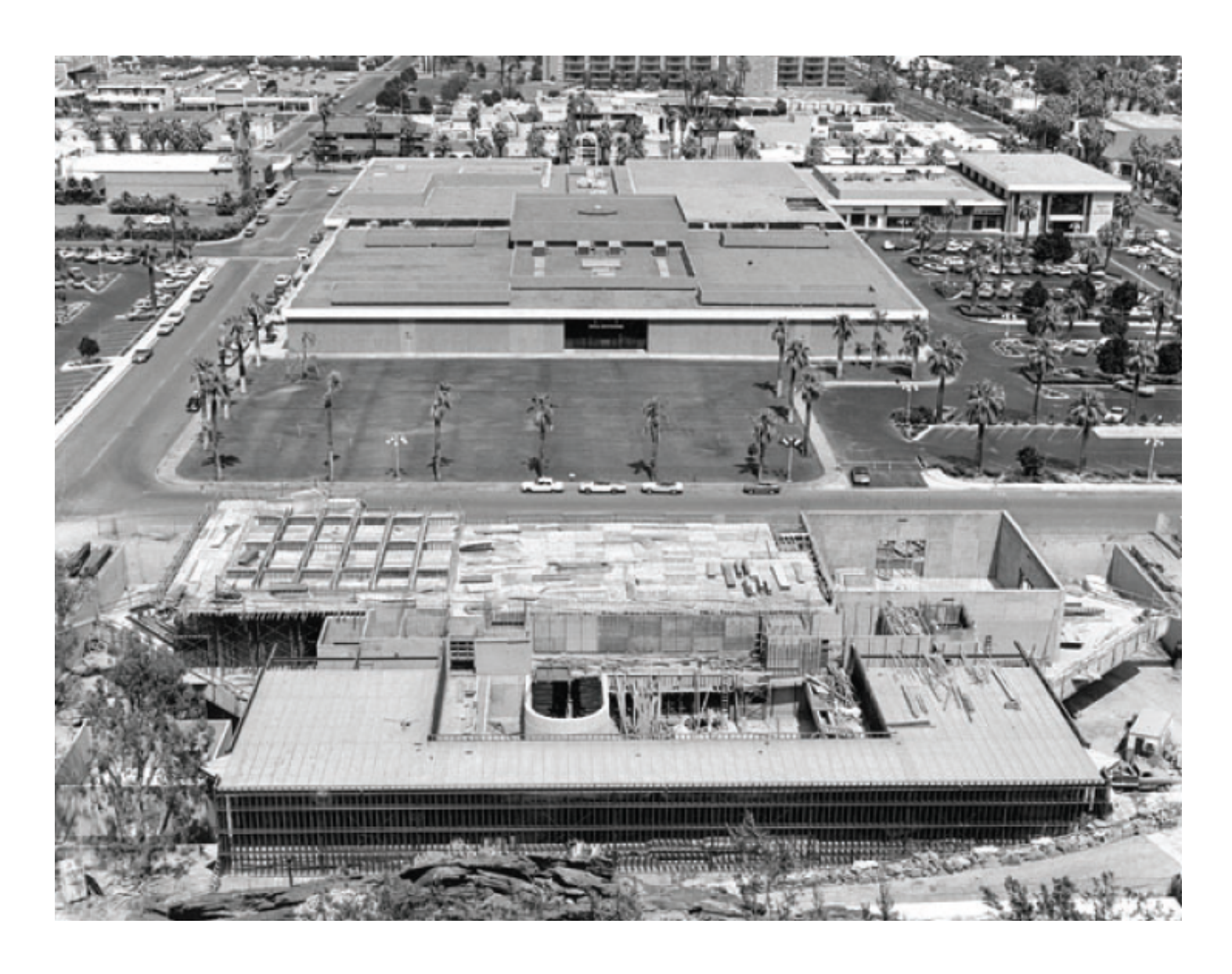
Aerial view of construction in process at Museum Drive, 1970s