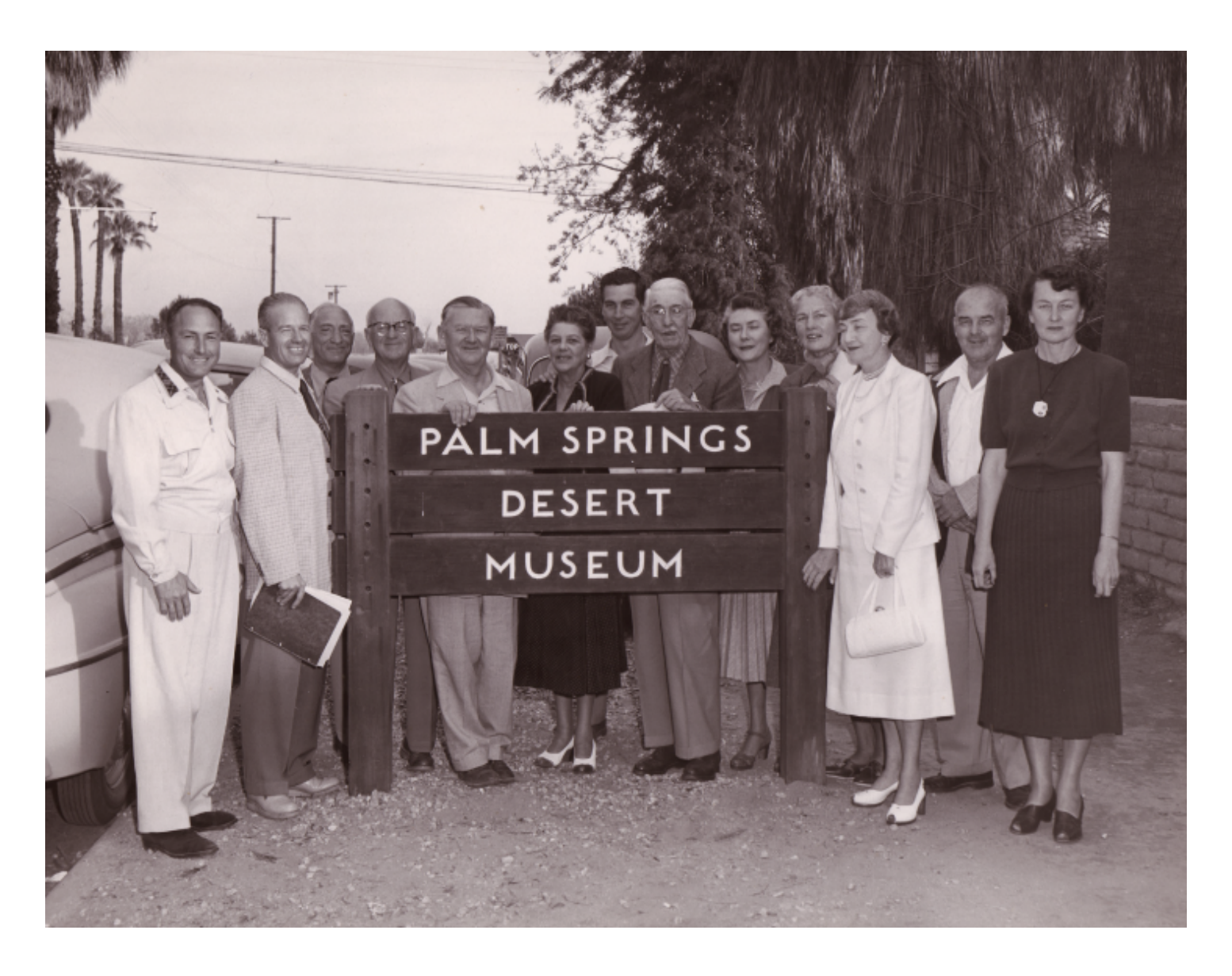
Palm Springs Desert Museum first Board Members, 1958