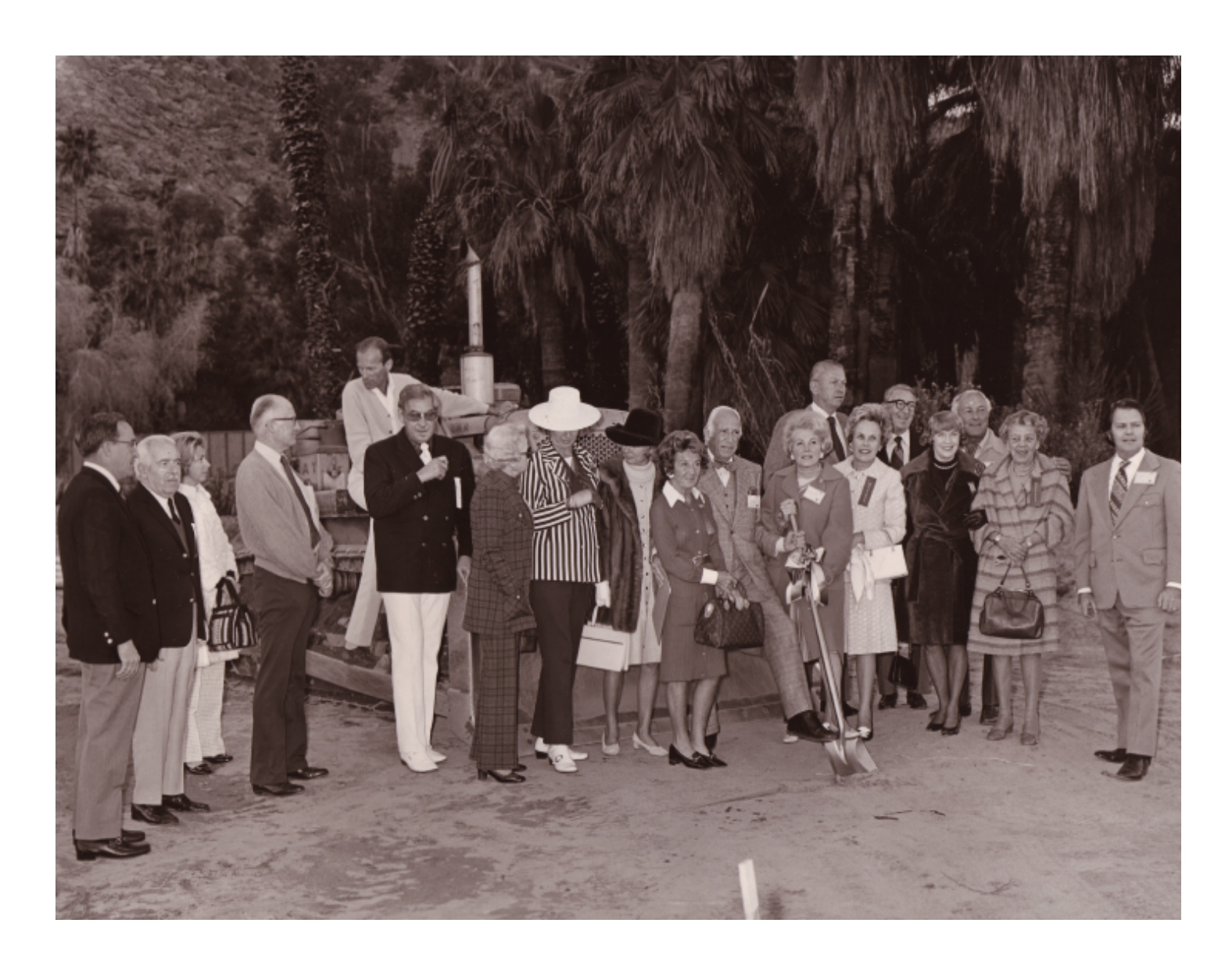
Leonore Annenberg (with shovel) at the groundbreaking for the Museum Way building, early 1974