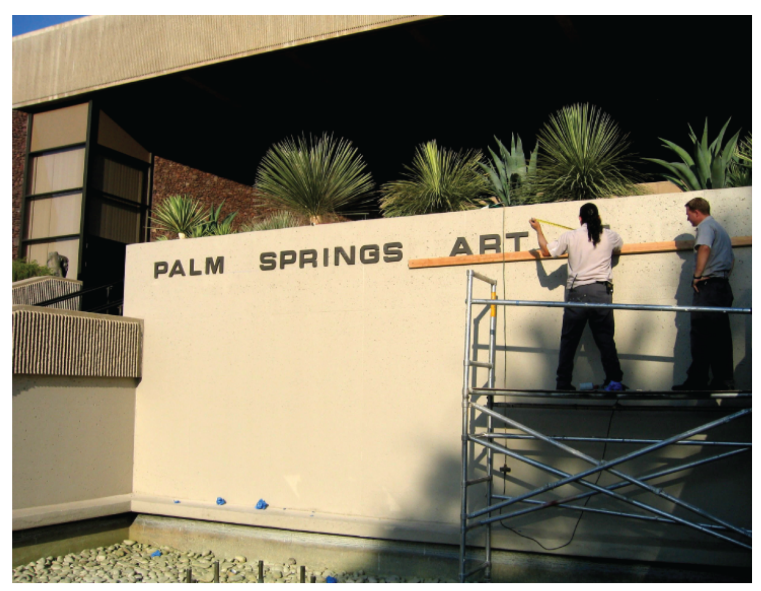
Changing of the name, 2005

The museum remains committed to serving as an innovative community cultural center, and expanding its exhibitions, programs, and services in the visual and performing arts.