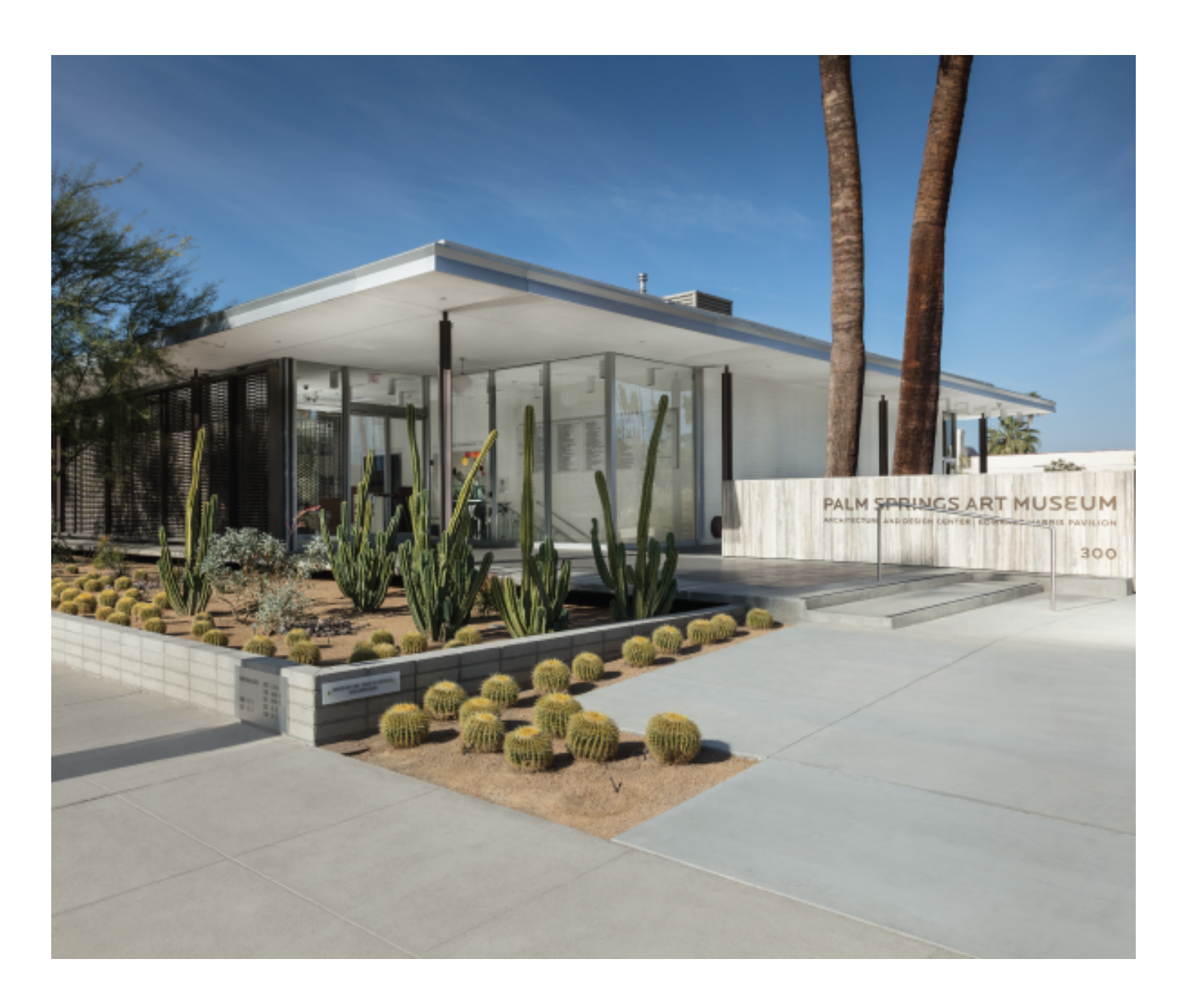
Palm Springs Art Museum, Architecture and Design Center, Edwards Harris Pavilion, 2017

In 2011, the museum purchased the Santa Fe Federal Savings & Loan building designed by E. Stewart Williams in 1960. Located in downtown Palm Springs, it was reopened as the Palm Springs Art Museum Architecture and Design Center, Edwards Harris Pavilion in 2014. This hub of the museum's exploration of architecture and design features related exhibitions and educational programs.