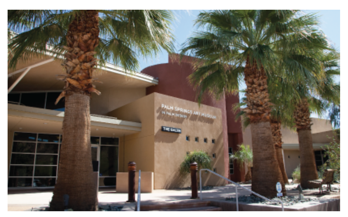
Palm Springs Art Museum in Palm Desert, 2017

In 2012, the museum opened a satellite exhibition and education space in Palm Desert. It features an architecturally distinctive building named The Galen that presents ongoing and temporary exhibitions of internationally important art and is surrounded by the Faye Sarkowsky Sculpture Garden that features significant sculpture works surrounded by beautifully landscaped gardens.