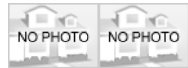
1977 - The Mac Renfro House. Unbuilt.