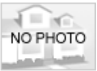
2018 - Casitas for Austick, Palisades Drive, Palm Springs CA. Kaptur is also working on a remodel.