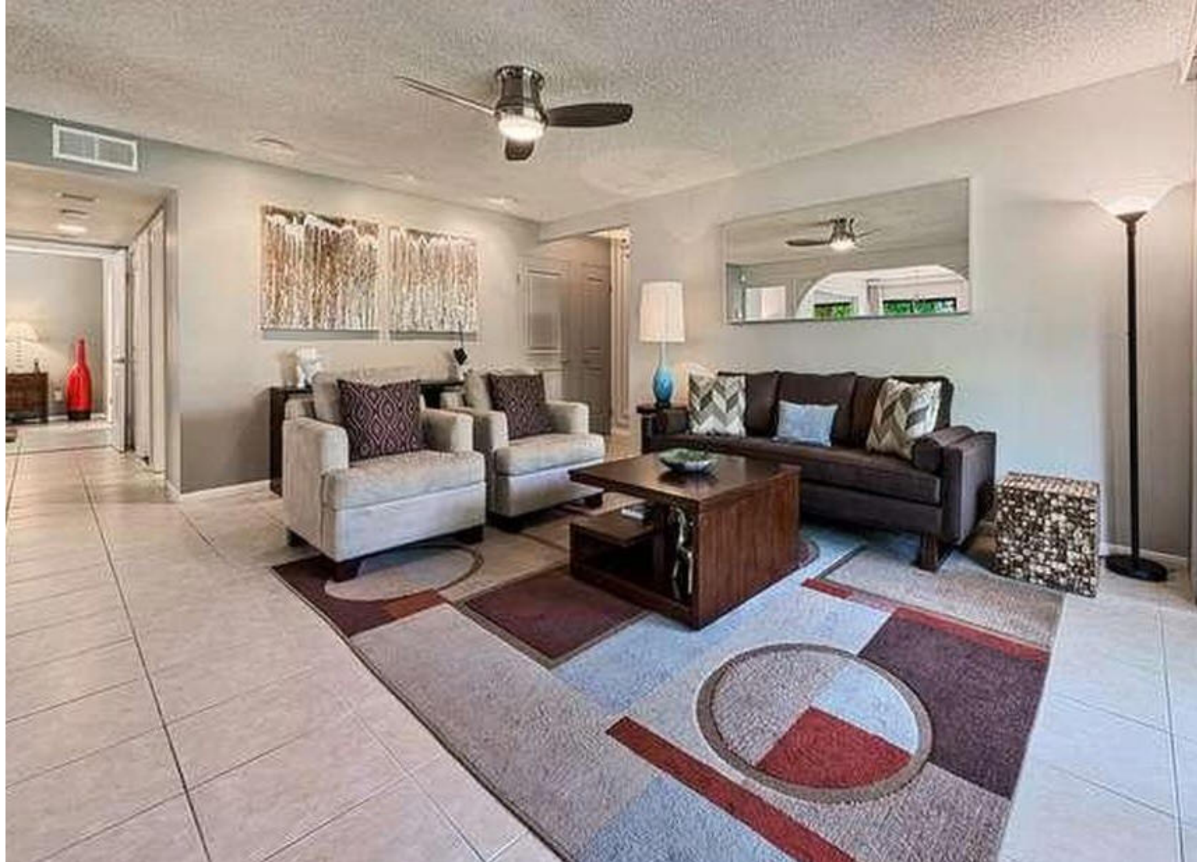
1979 - The Tumanjan Apartment Complex, 3155 Ramon Road , Palm Springs CA. Commissioned 1978. Changed name to Palm Villas. Sample unit, above.