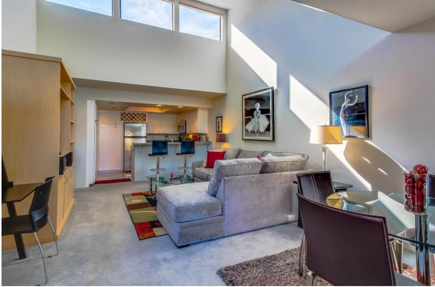
1984 - The Palm Springs Deauville Condominiums, 500 East Amado Road , Palm Springs CA. 168 units ranging in size from 736 sq. ft. to 1,259 sq. ft.