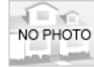
1957 - The Fisher House, Indian Wells Country Club, Indian Wells CA.