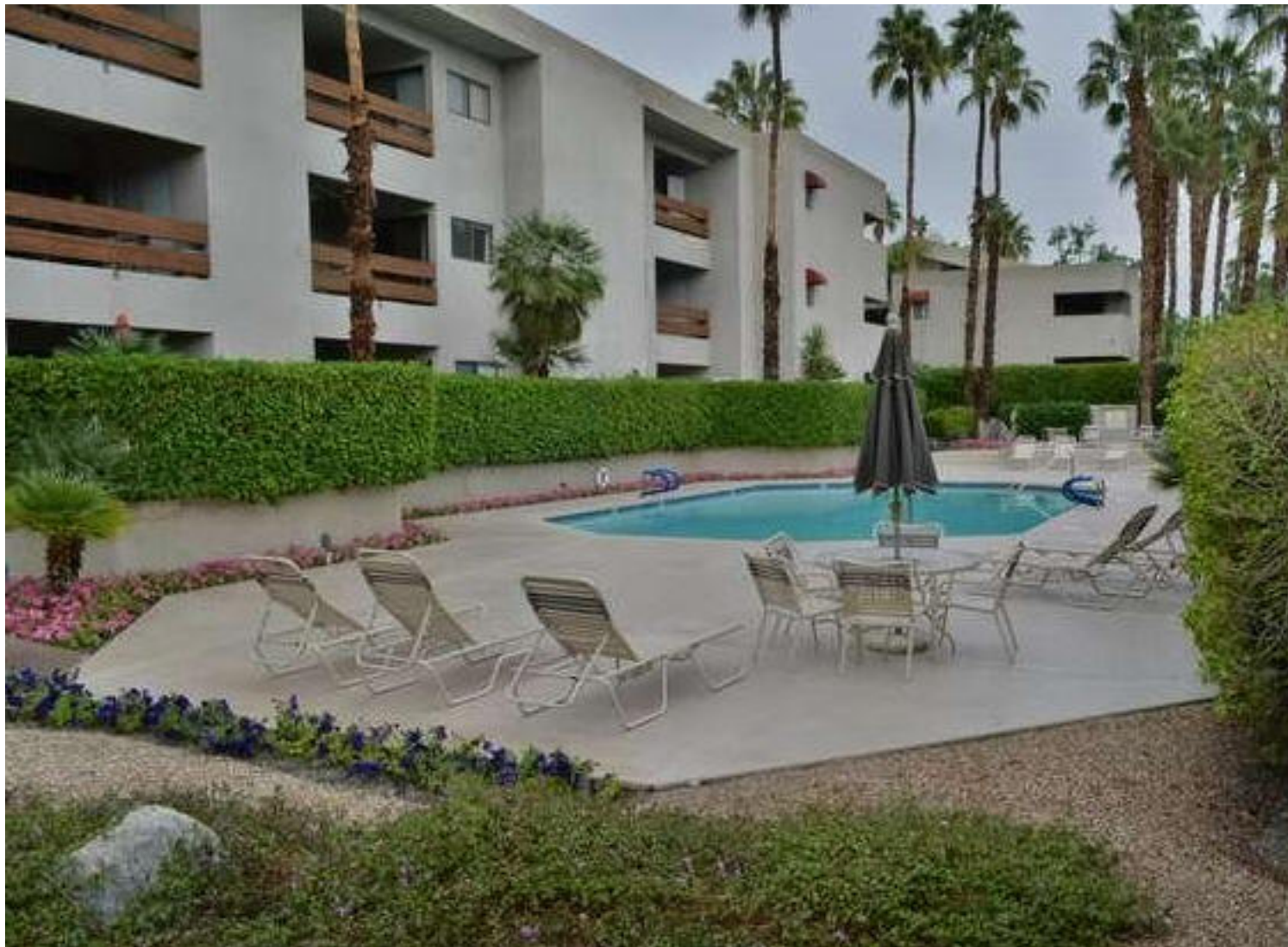
1985 - The Villa Caballeros Condo Project, 255 S Avenida Caballeros , Palm Springs CA. 59 units.