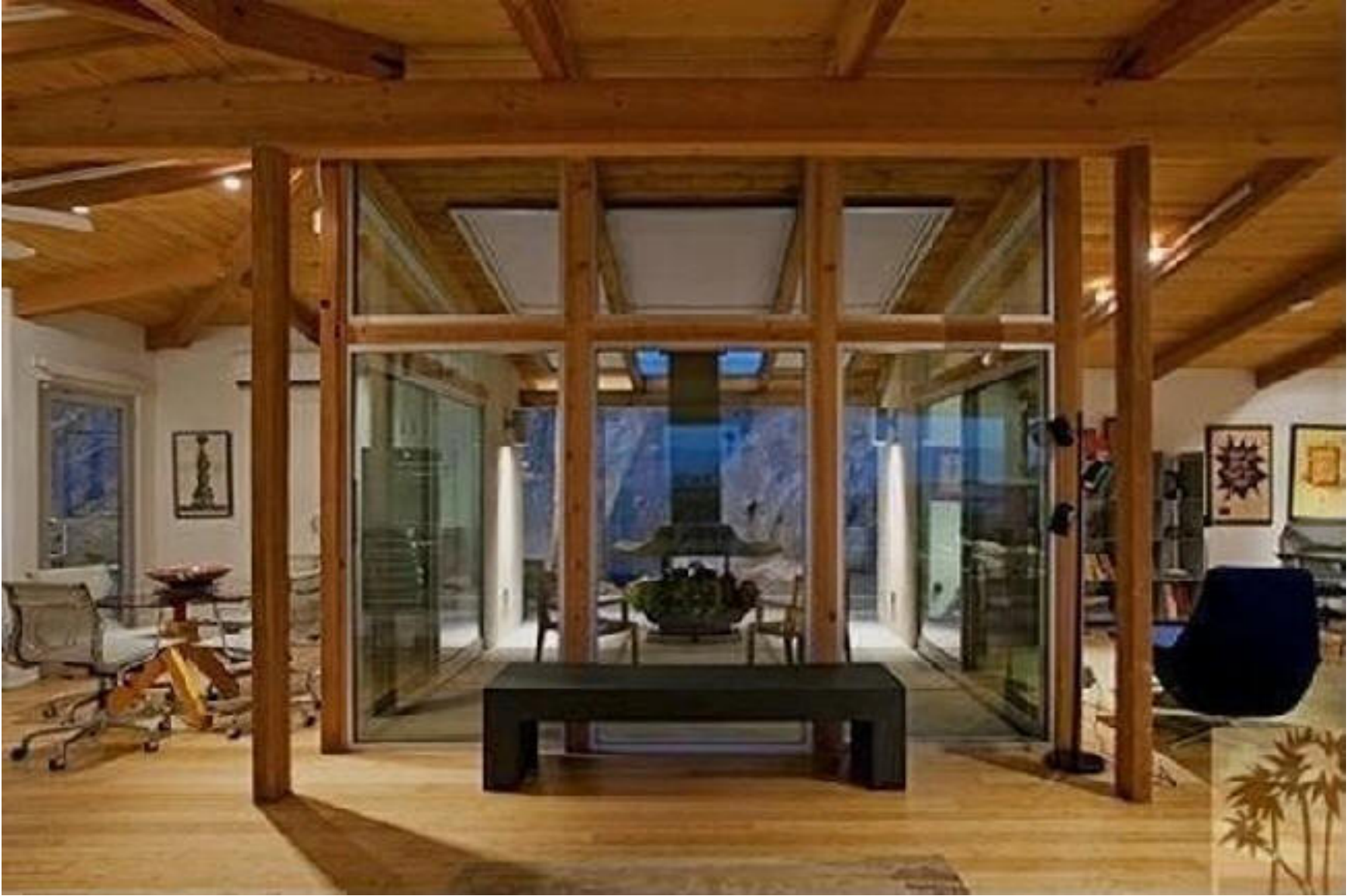
1959 - The Earl Stroube Spec House II, 1935 South Camino Monte , Palm Springs CA.