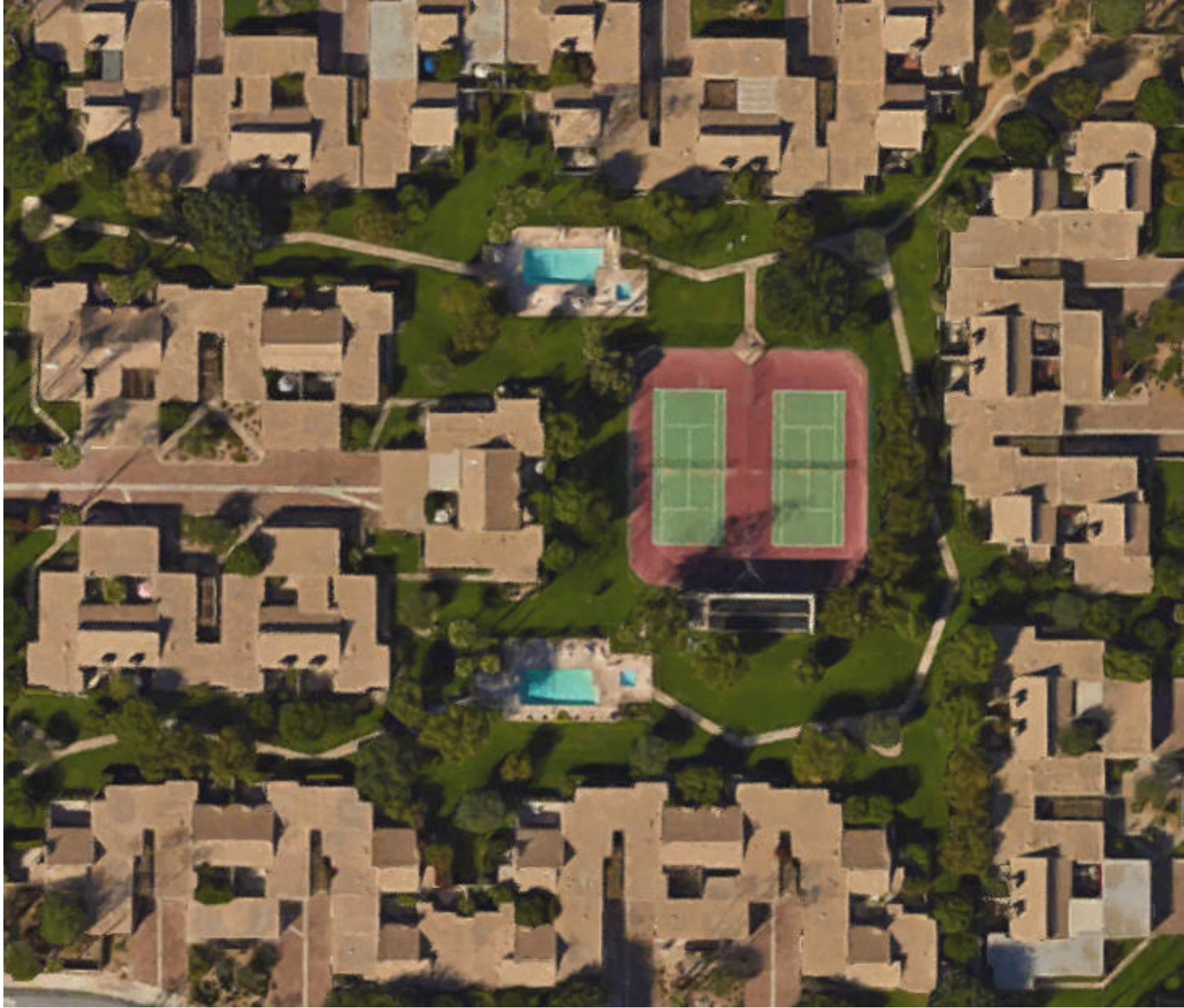
1976 - The Saddle Rock Condominiums, 1602 South Cerritos Drive , Palm Springs CA. Commissioned 1975.