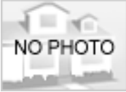
1969 - The Edward King House, Movie Colony neighborhood, Palm Springs CA. Need address.