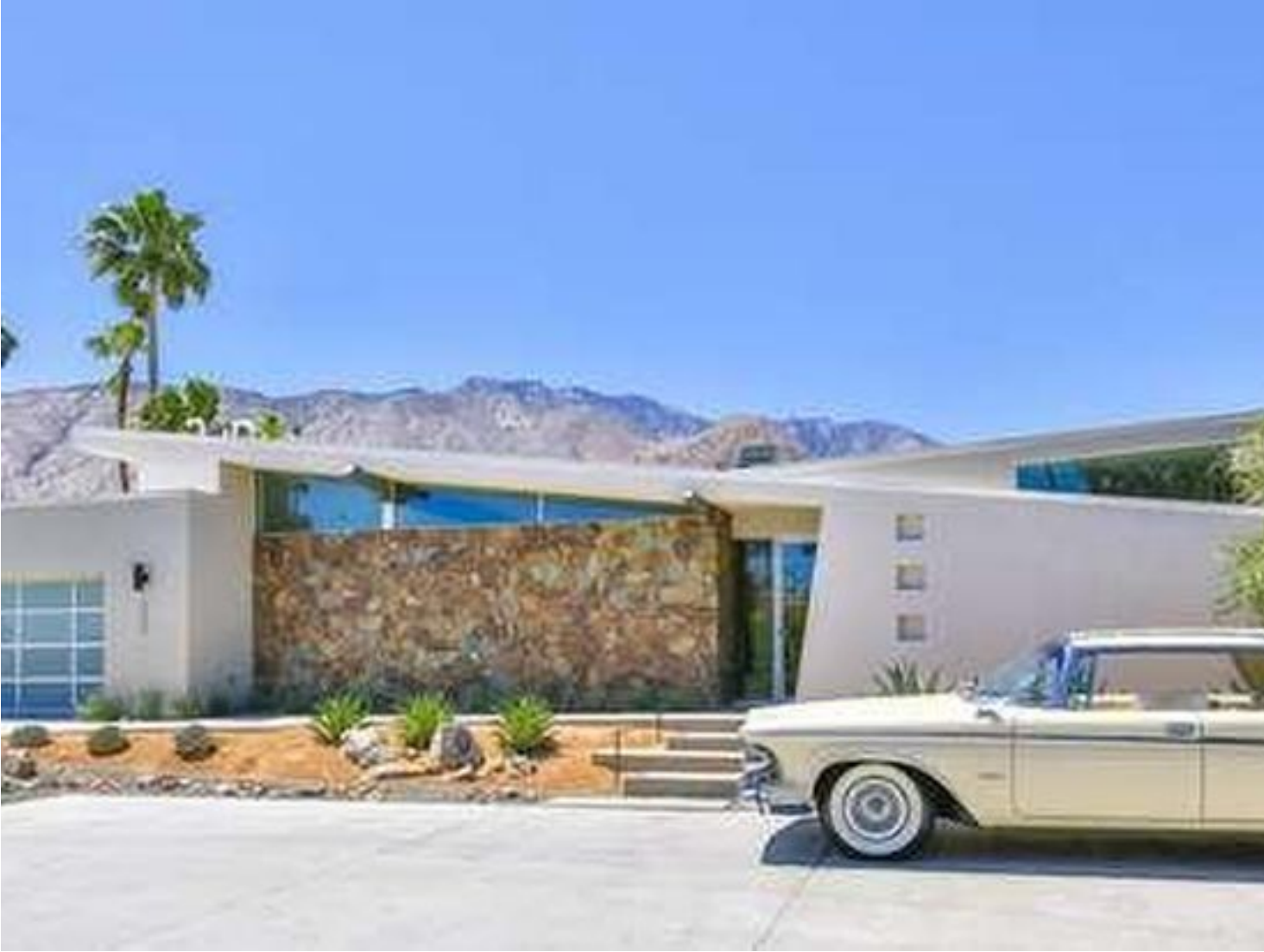
2016 - 264 West Vista Chino , aka Kaptur Court, Palm Springs CA. Built by NDC Homes. Sold in 2017. Identical to 262.