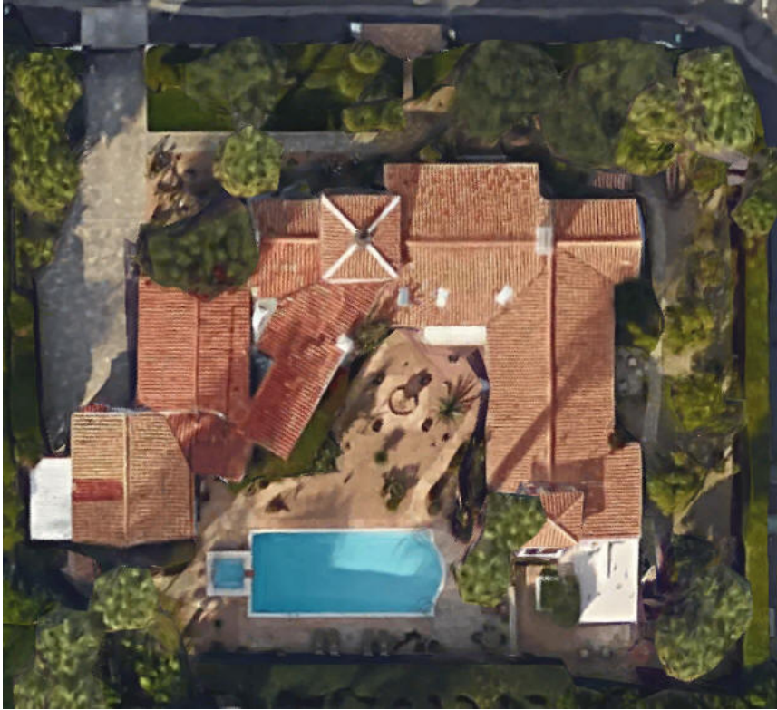
1934 - The Spencer Kellogg House and Studio, 321 West Vereda Sur, Palm Springs CA.