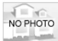
1936 - The Francis Crocker House, 330 West Arenas Road, Palm Springs CA. Address needs verification.