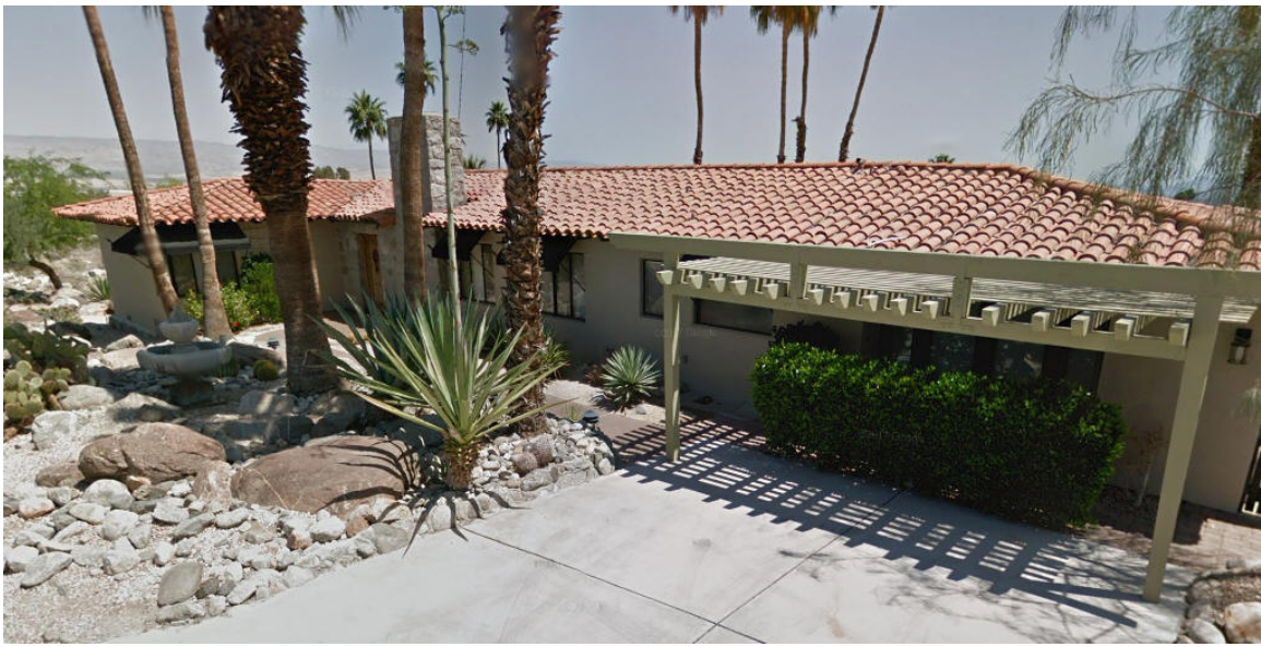
1942 - The Paul Dougherty House, 1860 North Vista Drive, Palm Springs CA.