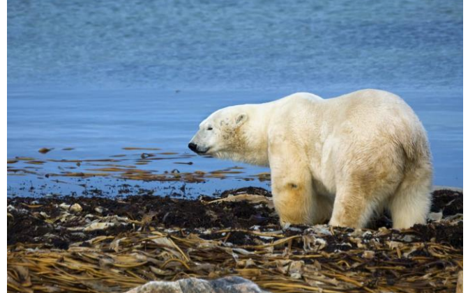
5 | P a g e