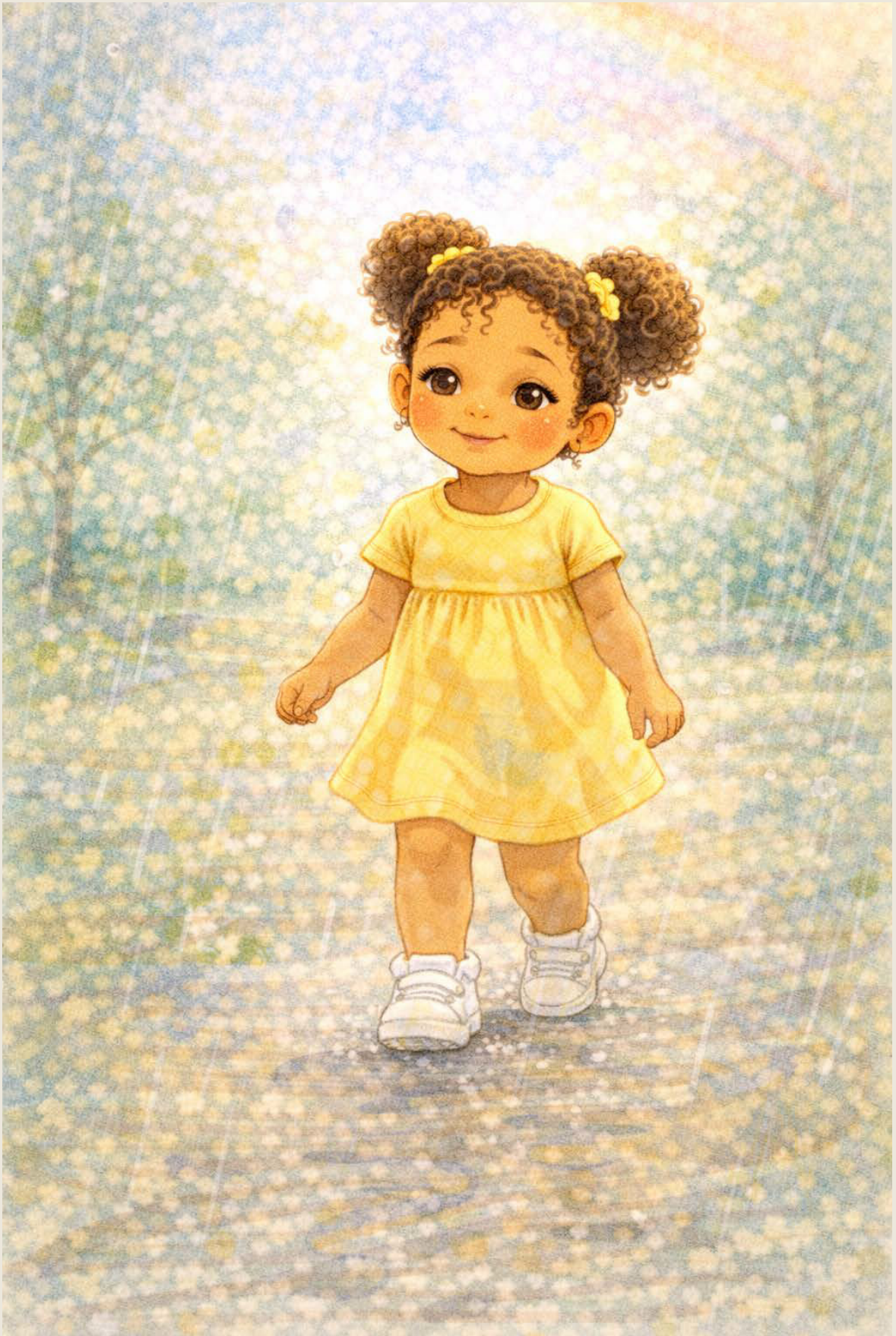
Lily keeps smiling through hard days.