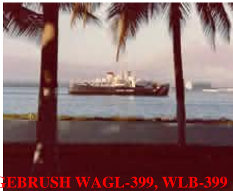
SAGEBRUSH WAGL-399, WLB-399

The Cuyahoga was designed for outer line patrol during Prohibition. She was commissioned on March 3, 1927. On May 29, 1933, Cuyahoga went to the Navy Yard in Washington to assume the duties with the Navy as a tender for the Presidential Yacht USS Potomac. She was returned to the Coast Guard on May 17, 1941, and commissioned by the Coast Guard. During the war she spent most her time in the Caribbean escorting vessels between Guantanamo bay, Trinidad and Paramaribo. On October 20, 1978, she was hit on her starboard side between amidships and stern by the Argentine coal freighter Santa Cruz . She was dragged and then fell away, rolled on her side and sank within a couple minutes. Eleven Coasties were lost. She was sunk as a artificial reef off of the Chesapeake Bay approaches. She sits upright in about one hundred feet of water. Her full sea service history and description of her sinking can be found on the Coast Guard Historian Page.