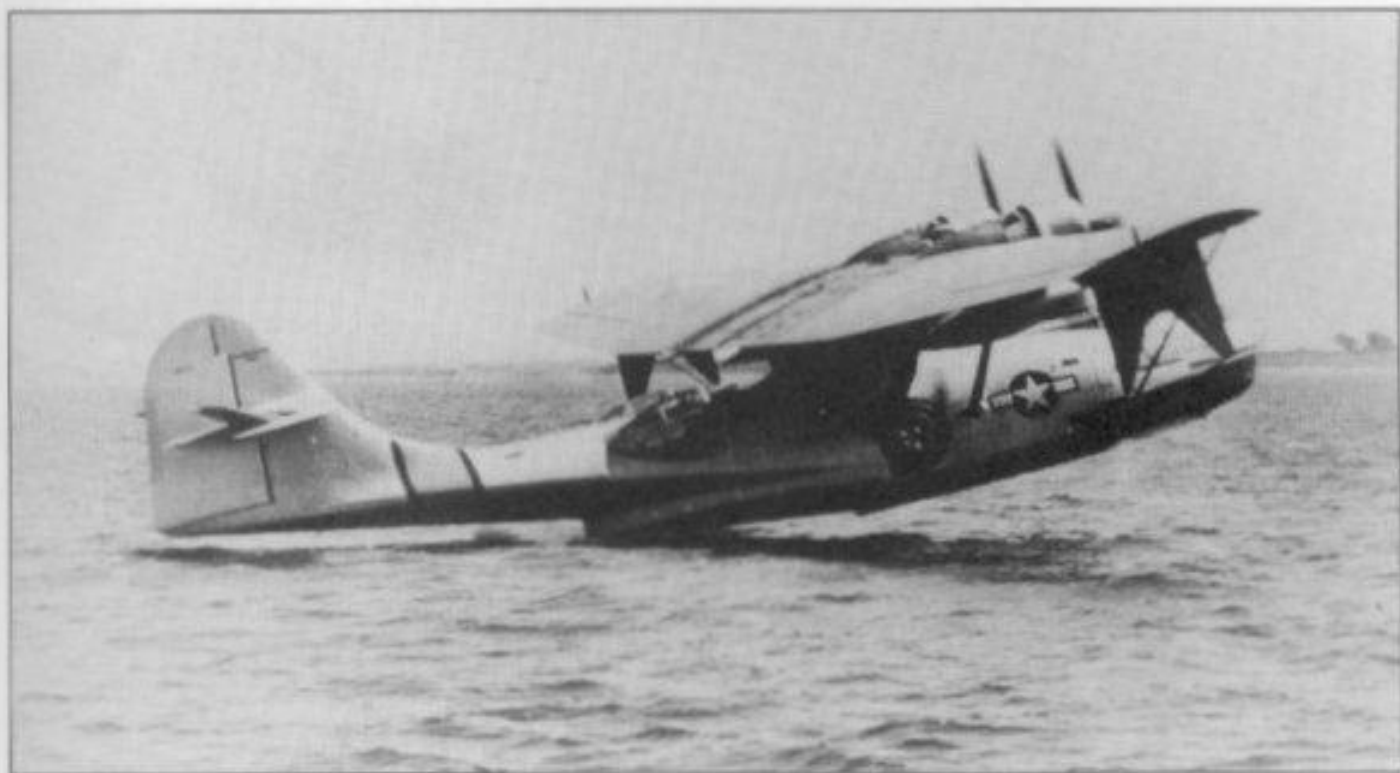
Starting in 1944, Quonset had a full-time PBY-5A-equipped Coast Guard Air-Sea Rescue Unit.