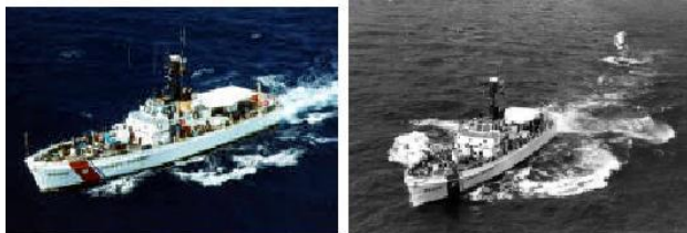
CAPE STRAIGHT WPB-95308

There is no photo available for the Red Oak. The above photo is of the Red Birch WLM-687. If anyone out there with a photo of her, let us at the Museum know so we can add it to our collection. The 157 foot coastal buoy tenders served between 1964 and 1971. The Red Oak was commissioned December 17, 1971 and decommissioned March 28, 1996, due to mandated reductions in the FY 96 budget. She was assigned to the 5th Coast Guard district out of Gloucester City, New Jersey. She tended aids to navigation from the Ship John Shoal Light to Trenton, New Jersey. She also refueled the lighthouse at Brandywine Shoal. The Red Oak was awarded the Coast Guard Meritorious Unit Commendation several times for aids to navigation work and environmental protection work. She was sunk as a artificial reef in 1999. She lies upright in about 165 feet of water as part of the Cape May Reef.