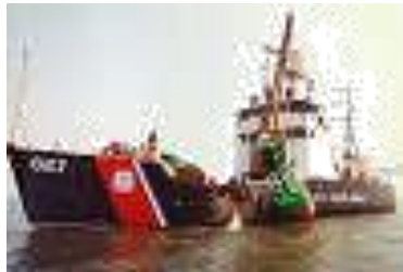
RED OAK WLM-689

The wrecks of the New Jersey artificial reefs will be the last of this article. The New Jersey Reefs probably have one of the highest concentration of wrecks in the reef program. Everything from subway cars to Coast Guard cutters. I am going to list just some of the more noteworthy Coast Guard boats and Cutters.