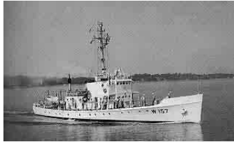
CUYAHOGA WIX /WMEC/WSC-157, 1927

She was also used to break up ice in the Hudson River and in and around New York harbor and Staten Island. She also was used to break up ice in the Hudson River and in. She was awarded several commendations and service ribbons. She was decommissioned on June 18, 1997 and returned to the Coast Guard Yard and prepared for her duty as a artificial reef. She was sunk on June 10, 2000, as an artificial reef twenty miles off the coast of Ocean City, Maryland.