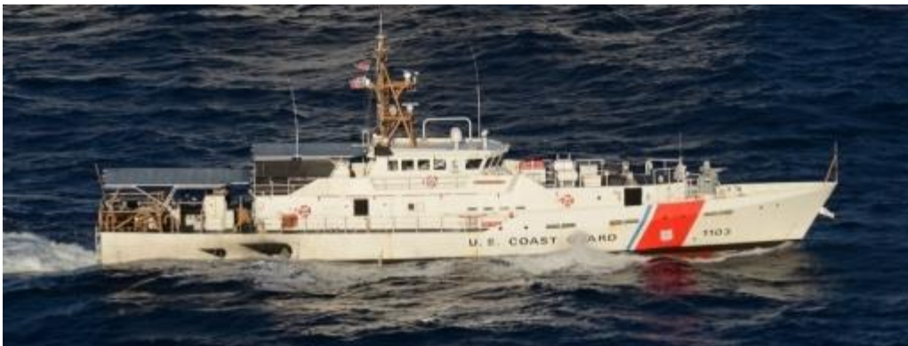
CGC WILLIAM R. FLORES WPC-1103