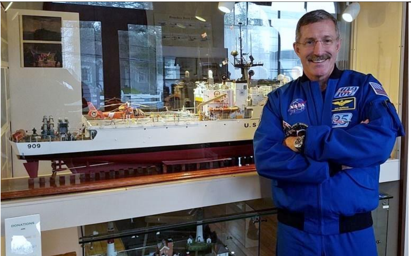
USCG ASTRONAUT CAPTAIN DAN BURBANK VISITS THE MUSEUM IN APRIL 2017.