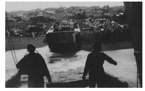
Photo taken by CM3 DiRosario on February 22, 1945, showing the debarking of its cargo on the beaches of Iwo Jima. (courtesy Jack DiRosario)

dirt of Iwo island is on the decks of this LST tonight.