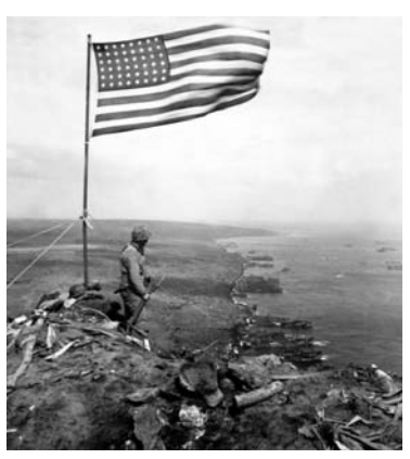
Famed flag planted at the top of Mt. Suribachi by U.S. Marines.

The Battle of Iwo Jima was supported by thousands of Coast Guard officers and men serving in transports, on board landing craft and on the beaches. Over the course of the one-month battle, U.S. forces suffered nearly 5,000 killed and 16,000 wounded while enemy dead numbered over 21,000 or nearly the