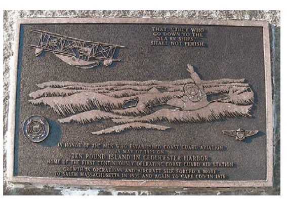
Commemorative plaque at Ten Pound Island

The duties listed by the Commandant were possibly the first SOPs (Standing Operating Procedures) issued by Coast Guard Headquarters. Thus, OL-5 crews spent time hunting schools of fish for local fishing fleets, tracking icebergs, anti-smuggling operations, and, on one occasion during their law enforcement operations, machine-gunning and sinking 250 cases of liquor thrown overboard from a rum runner. The purchase of seven 'flying lifeboats' in 1932 put the air wing of the Coast Guard solidly in the search and rescue business. These amphibians were designed to land on water in rough seas and pick up survivors.