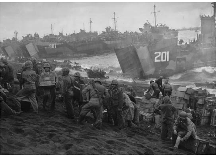
Troops, equipment and supplies landed on the beach by Coast Guard LSTs to support combat operations on Iwo Jima.

On March 4, well before the end of hostilities, the first crippled bomber made a forced landing on Iwo Jima, proving the strategic importance of the island. Not long after that, U.S. fighter aircraft took up station at the newly-occupied airbase to provide protection to the bombers to and from their targets in Japan. On March 16th, D-Day plus 25, organized resistance on Iwo Jima was declared over.