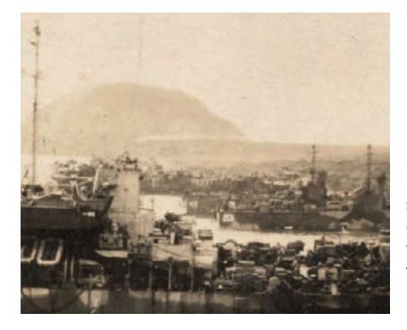
showing LSTs unloading cargo; Mt. Suribachi rising from the fog of war in the background.

The Battle of Iwo Jima was supported by thousands of Coast Guard officers and men serving in transports, on board landing craft and on the beaches. Over the course of the one-month battle, U.S. forces suffered nearly 5,000 killed and 16,000 wounded while enemy dead numbered over 21,000 or nearly the