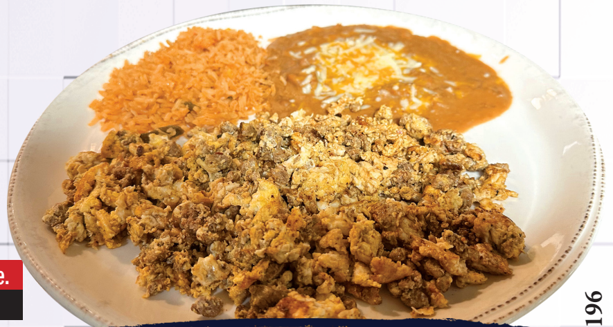
HUEVOS CON CHORIZO