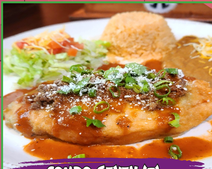
COMBO SEVEN (7)