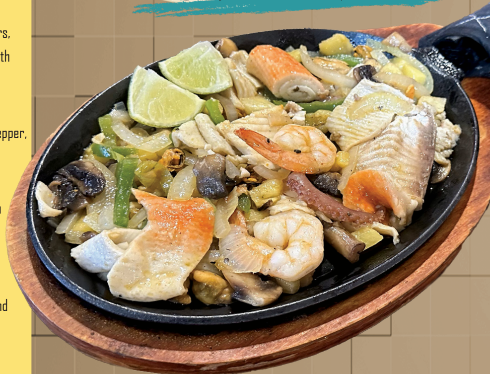
FAJITAS DEL MAR