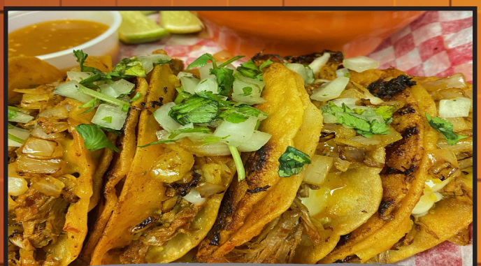
TACO DORADO DE BARBACOA