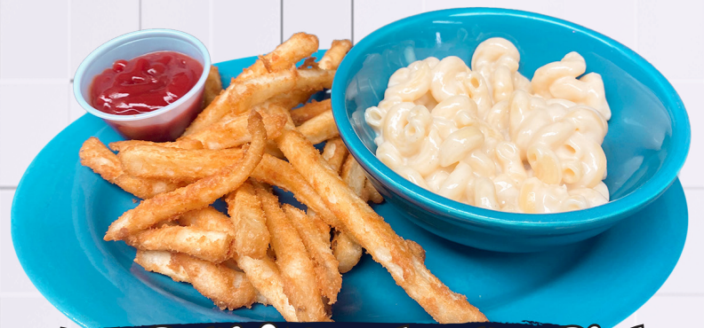
MACARONI & CHEESE AND FRIES