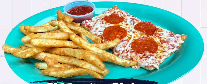
PIZZA AND FRIES