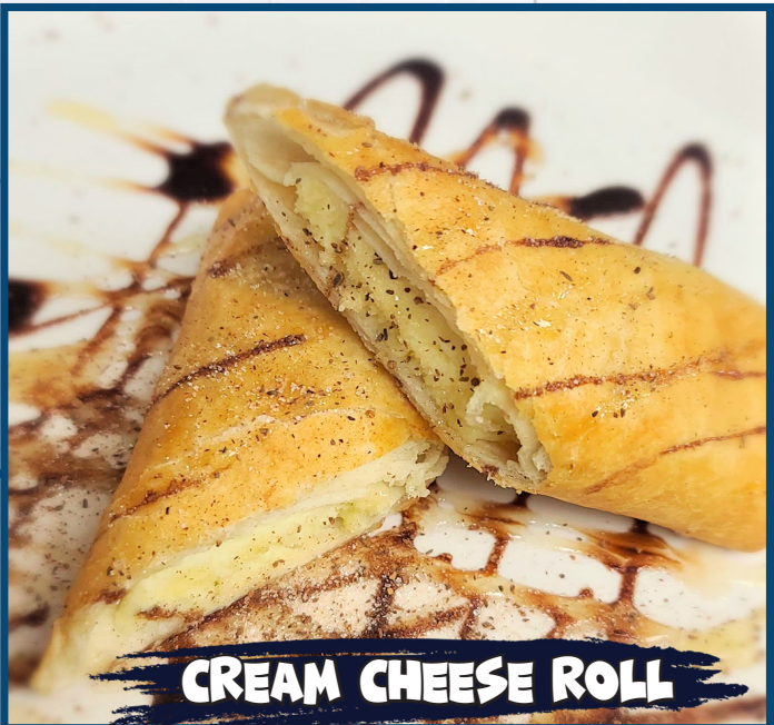
CREAM CHEESE ROLL