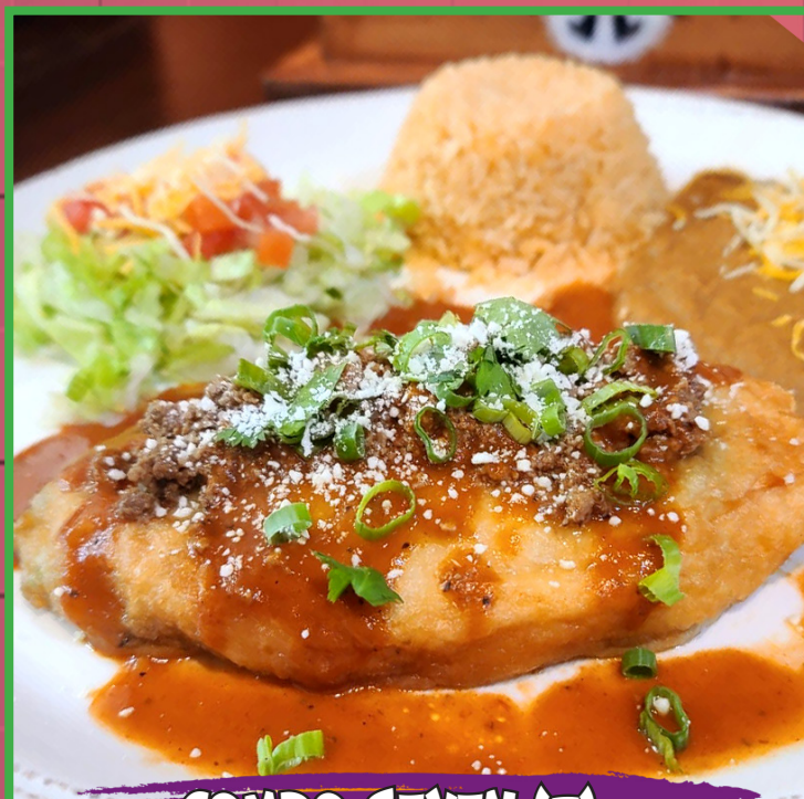
COMBO SEVEN (7)

3 Enchiladas your choice of Ground Beef, Shredded Chicken, Shredded Pork or cheese. Topped cheese dip green onion and shredded cheese. Served with rice and beans.