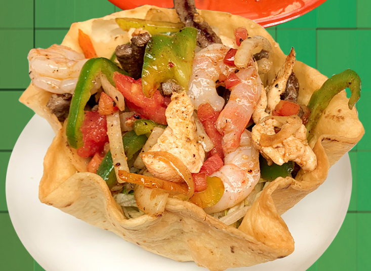
FAJITA TACO SALAD FELIZ