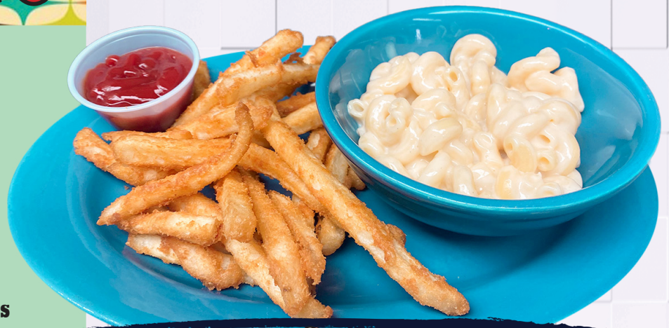
MACARONI & CHEESE AND FRIES