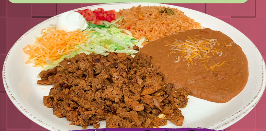
DISH AL PASTOR

Lengua/Tongue - Tripa/Tripe - Barbacoa/Shredded Beef.