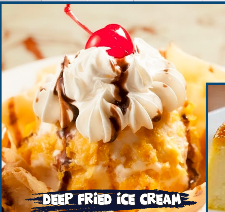
DEEP FRIED ICE CREAM