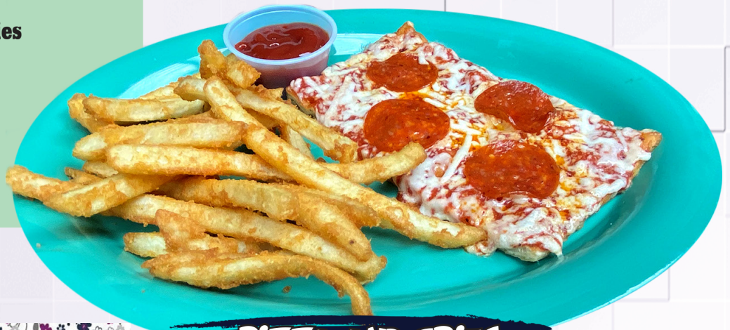
PIZZA AND FRIES