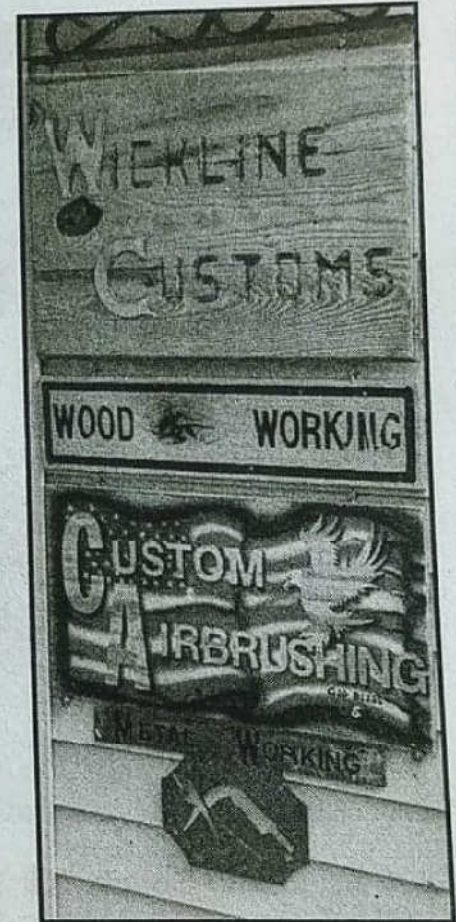
Wickline Customs is a new home-based business in Jefferson Township offering custom wood and metalworking as well as custom airbrushing and faux finishing work.

For more information on Wickline Customs, call 724-734-3777 or find them on Facebook.