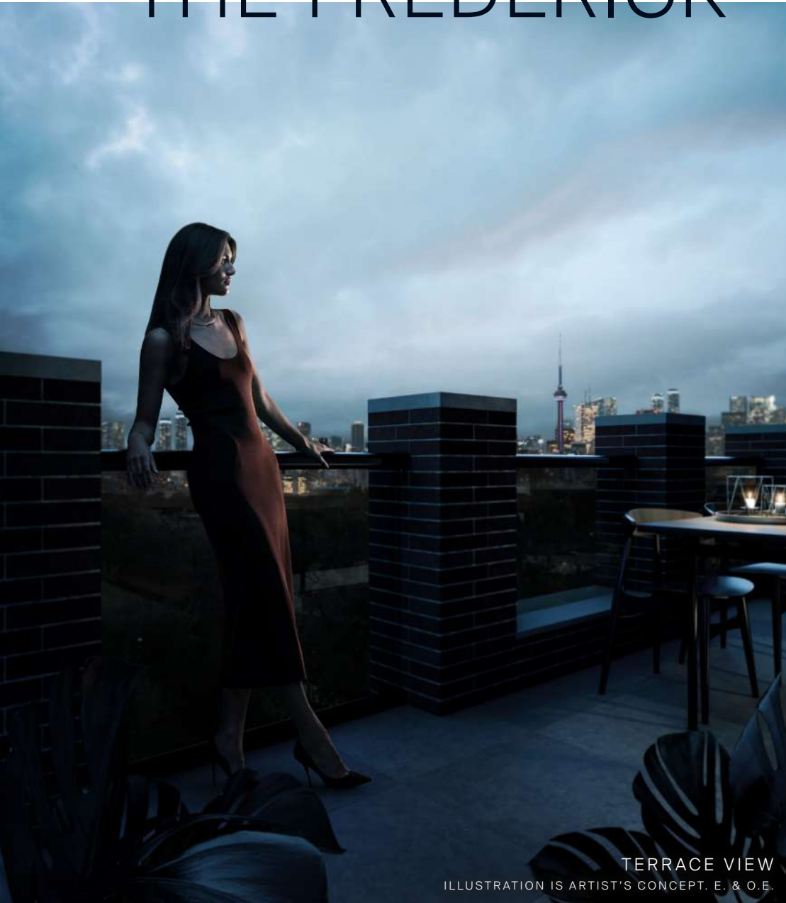
TERRACE VIEW ILLUSTRATION IS ARTIST'S CONCEPT, E. & O.E.