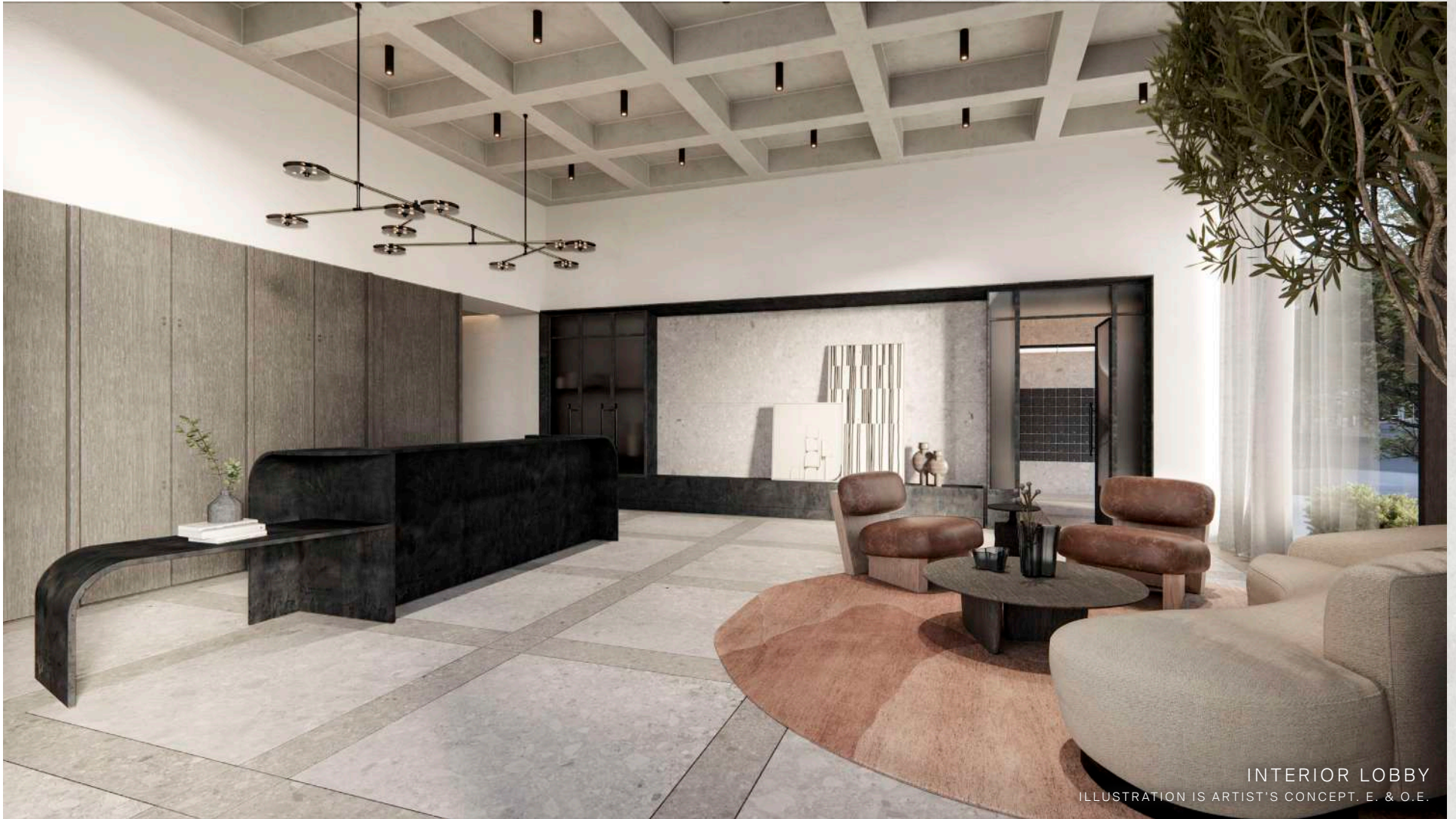
INTERIOR LOBBY ILLUSTRATION IS ARTIST'S CONCEPT. E. & O.E.