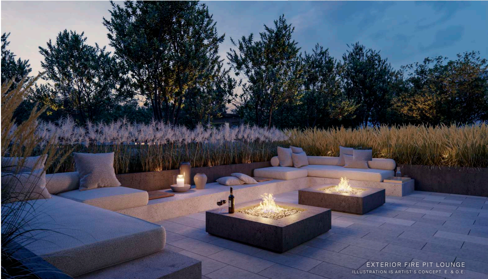
EXTERIOR FIRE PIT LOUNGE ILLUSTRATION IS ARTIST'S CONCEPT. E. & O.E.

“THE FREDERICK IS THE CROWN JEWEL OF THIS MASTER-PLANNED COMMUNITY. OVERLOOKING THE GARDEN-LIKE NEIGHBOURHOOD OF LEASIDE, IT COULDN'T BE MORE PERFECT - WHETHER IT'S THE SHOPS ON EGLINTON OR THE PEDESTRIAN MEWS, WE PAID SPECIAL ATTENTION TO CREATING A DESTINATION.”