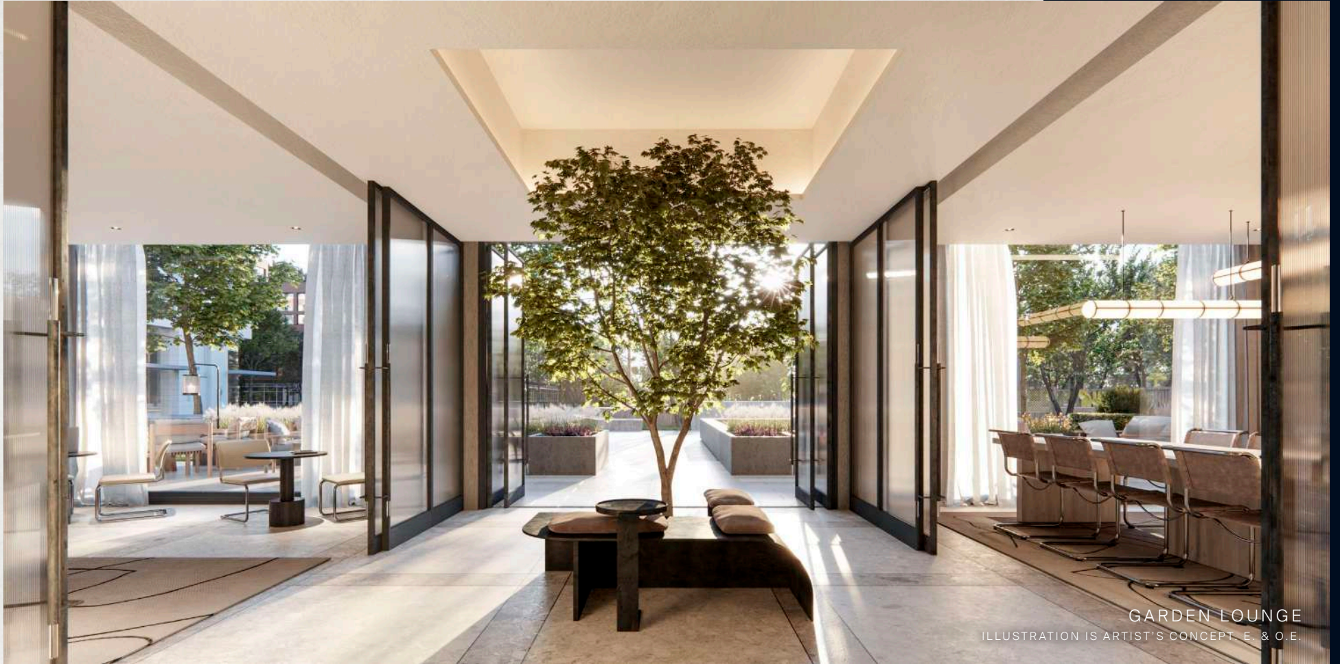
GARDEN LOUNGE ILLUSTRATION IS ARTIST'S CONCEPT, E. & O.E.