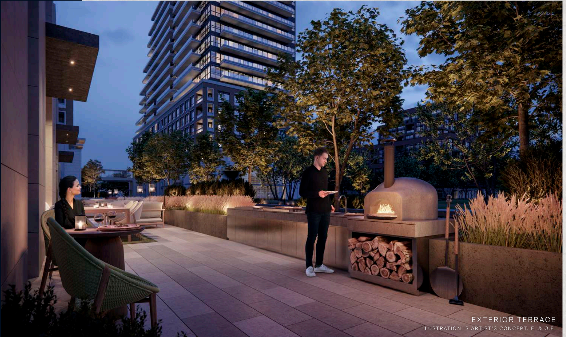
EXTERIOR TERRACE ILLUSTRATION IS ARTIST'S CONCEPT. E. & O.E.