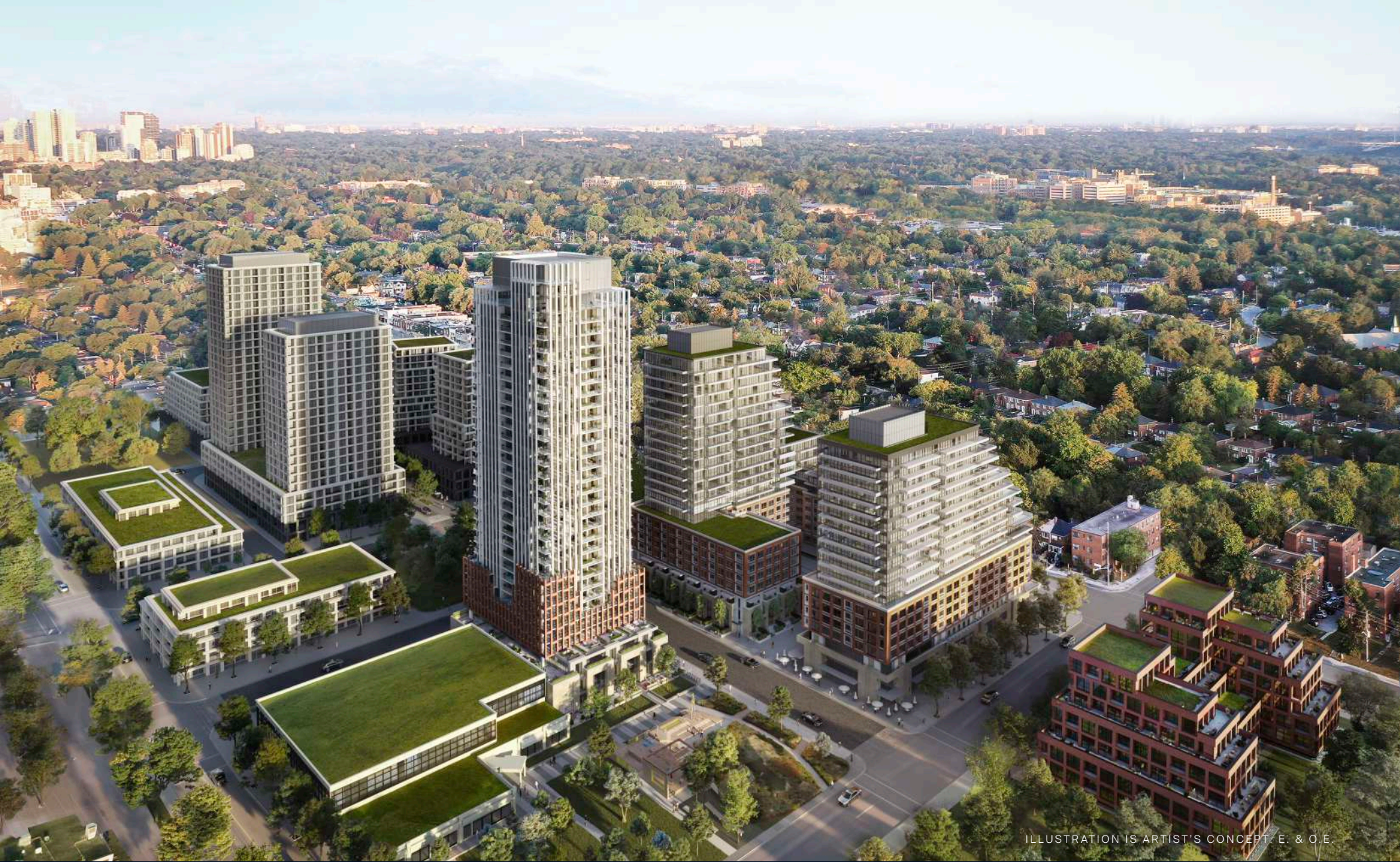
ILLUSTRATION IS ARTIST'S CONCEPT. E. & O.E.