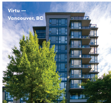
Virtu — Vancouver, BC