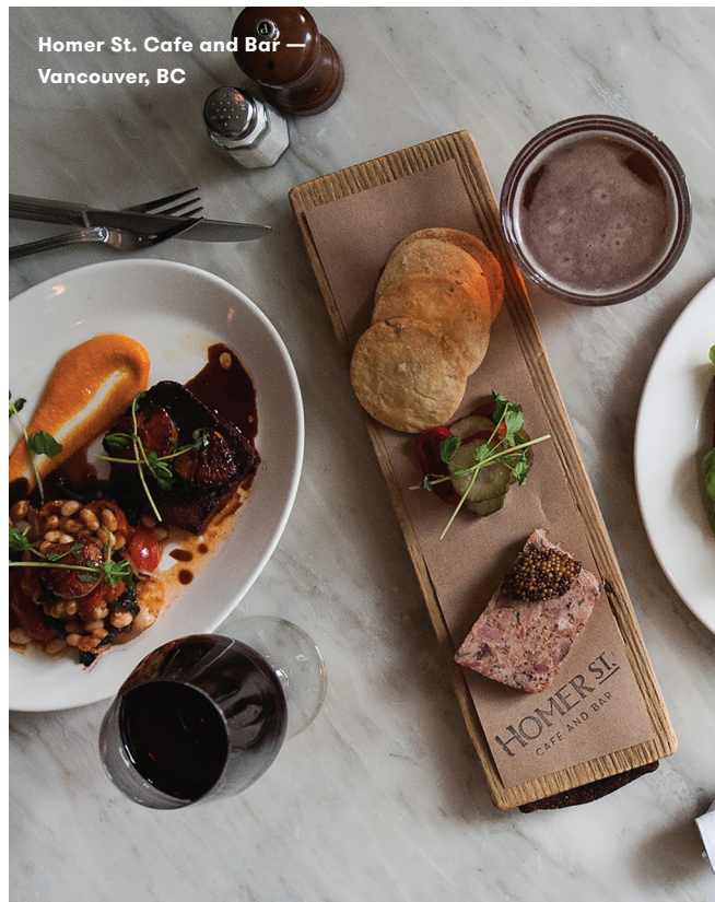
Homer St. Cafe and Bar — Vancouver, BC