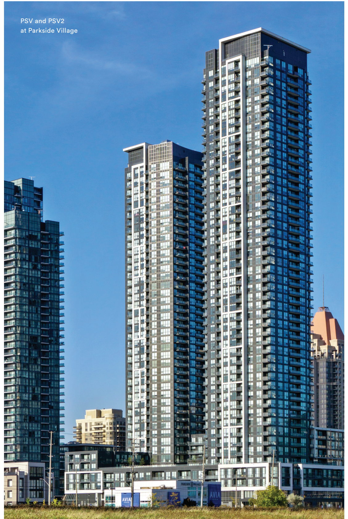
PSV and PSV2 at Parkside Village