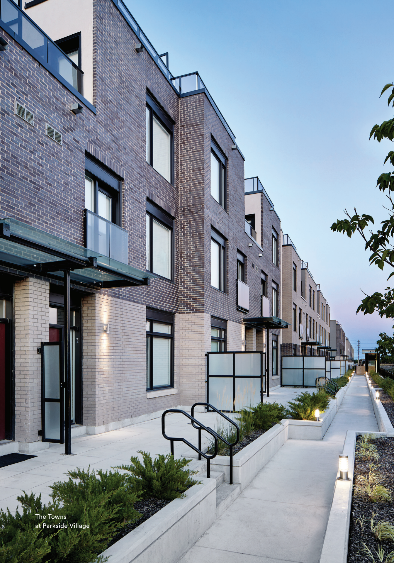
The Towns at Parkside Village