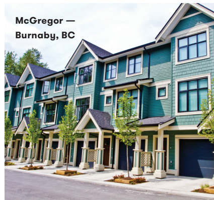
McGregor — Burnaby, BC