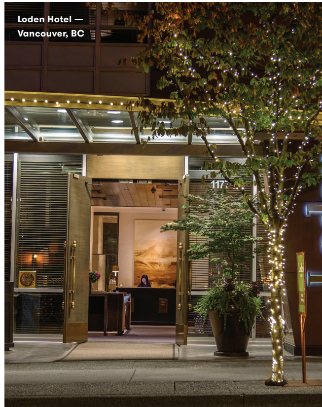
Loden Hotel — Vancouver, BC