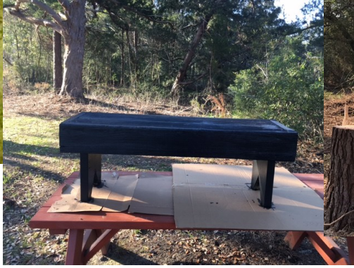
This is been Billy's view for the past week! Thank you Billy!