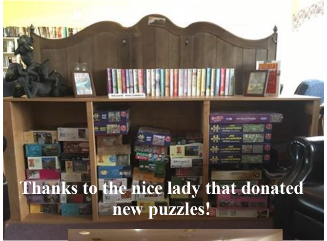
Thanks to the nice lady that donated new puzzles!