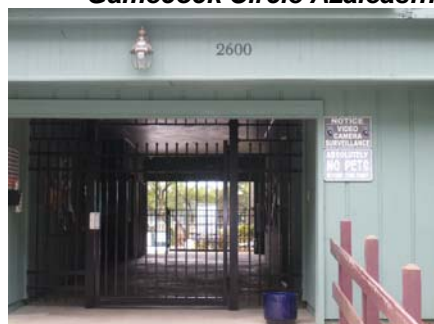
Clubhouse now has address of 2600 Little River Drive