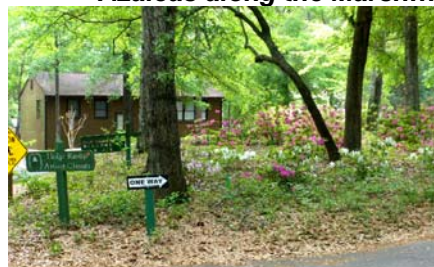
Gamecock Circle Azaleas...