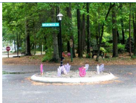
The new lamp posts and circle islands are in and will soon be filled with color!!