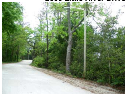
New light on road to Compound (another is at end of Swamp Fox)