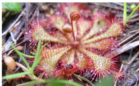
Sundew Drosera brevifolia