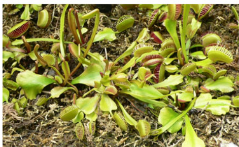
Venus Fly Trap Dionaea muscipula