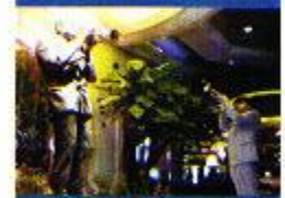
New Orleans - "Birthplace of Jazz"