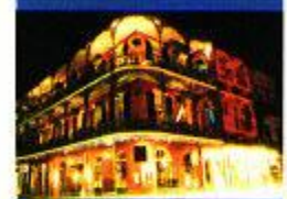
View the French Quarter

Mitchell or Gail Lassiter @ (910) 827-5249 or (910) 733-0984