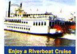
Enjoy a Riverboat Cruise