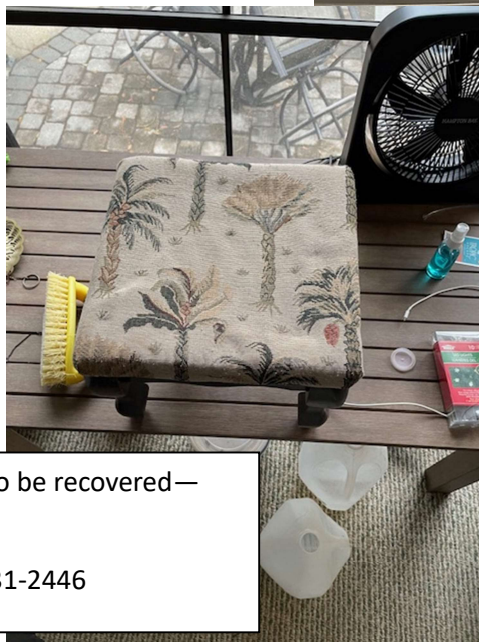
Small foot stool, needs to be recovered— free to another home