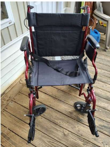
Purchased this new in September and only used it a handful of times, asking $250. My phone number is 216-712- 2925