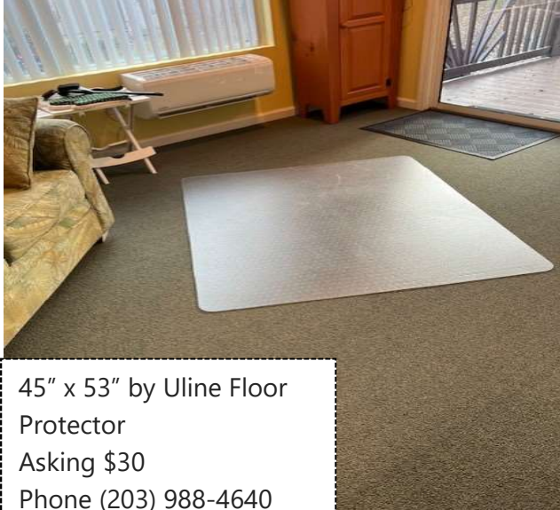
45" x 53" by Uline Floor Protector Asking $30 Phone (203) 988-4640