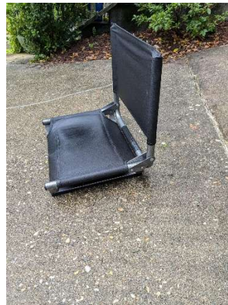
$15 Stadium Seat, folds down. Hardly used