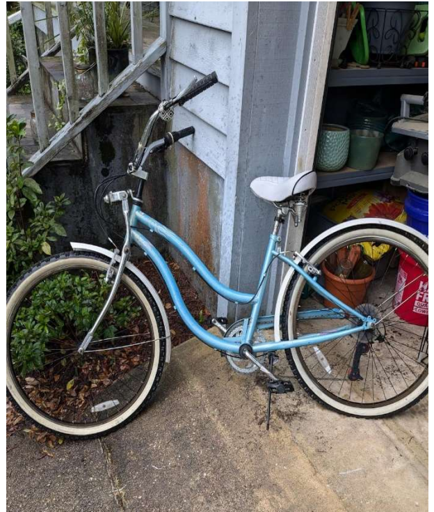
$30 ladies bike. Pedal braking works fine