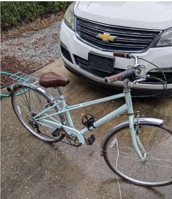
$40 Great condition, hardly used