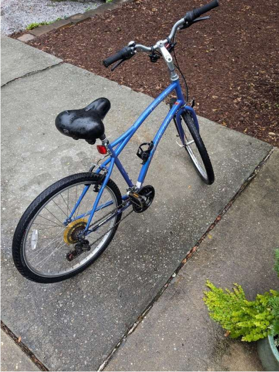
$15 Front brake broken, but back brake works fine

Bikes and stadium seat for sale Call or text 248-921-0068