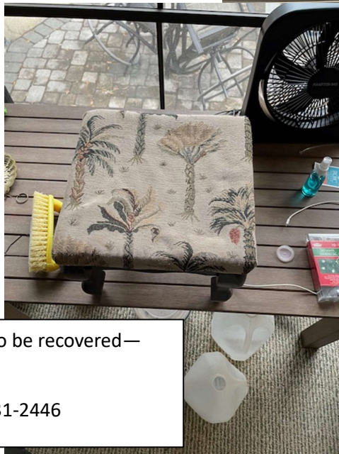
Small foot stool, needs to be recovered— free to another home