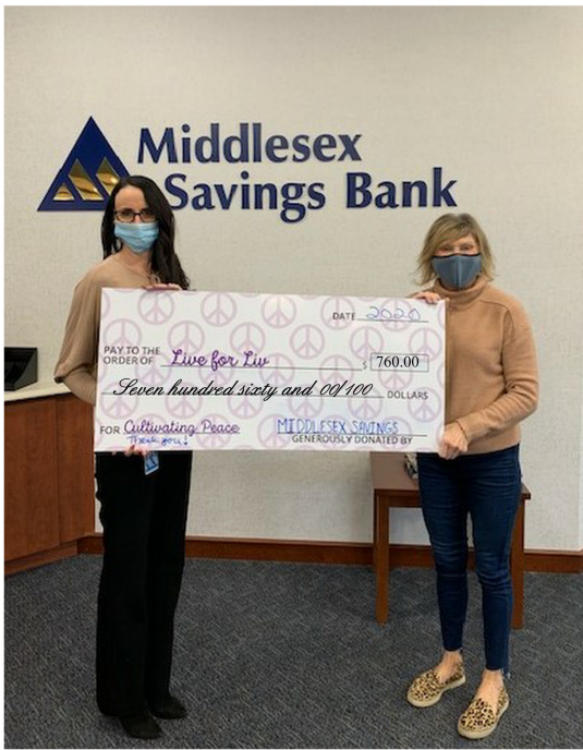
THANK YOU to the Middlesex Savings bank and their Employee Directed Giving Fund

A huge thank you Emerson Hospital for their generous grant to LIVE FOR LIV and our Annual Ride/Run Fundraising Event. We appreciate your support!!