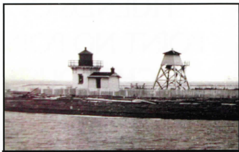
The PNP Light Station circa 1890

Washington's Point No Point Light Station is the oldest on Puget Sound. It is located on a low finger of land that the local Native American tribes had given the name Hahd-skus , meaning long nose. The Point No Point Treaty was signed on the spit in 1855 by Territorial Governor Isaac Stevens and leaders of S'klallam, Skokomish and Chimacum tribes.