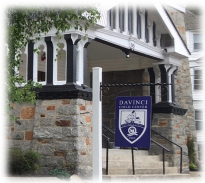
DAVINCI CHILD CENTER, LLC