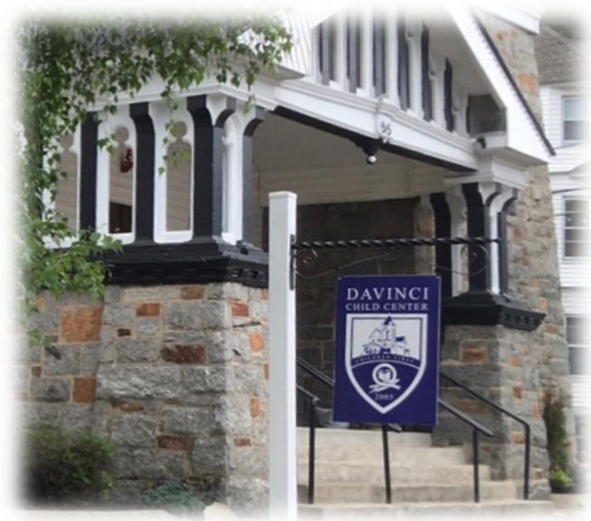
DAVINCI CHILD CENTER, LLC