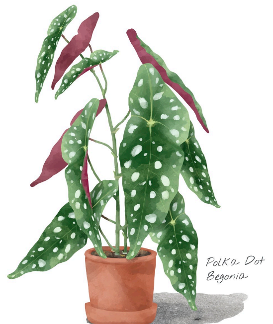
Polka Dot Begonia

Please Note: A discretionary 10% service charge will be added to your bill