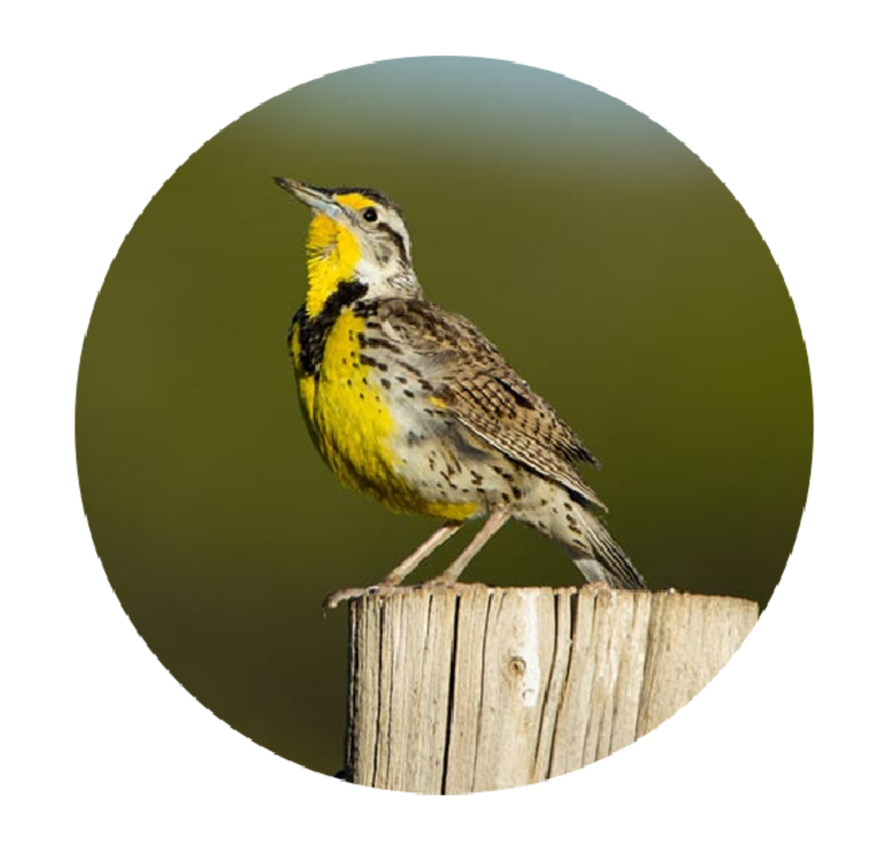
"Meadowlark" $50/1 Hr.