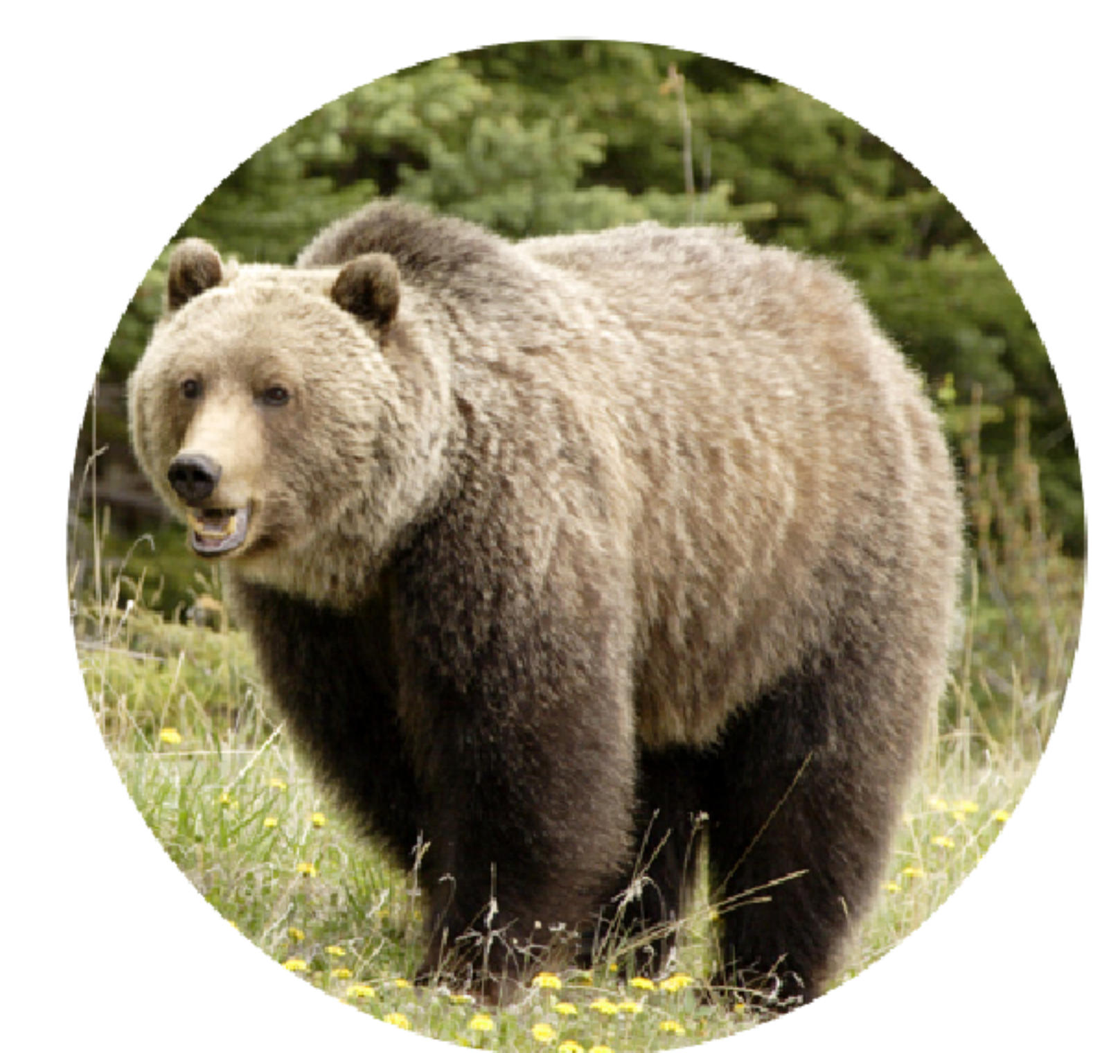
"Grizzly Bear" $400/2 Days