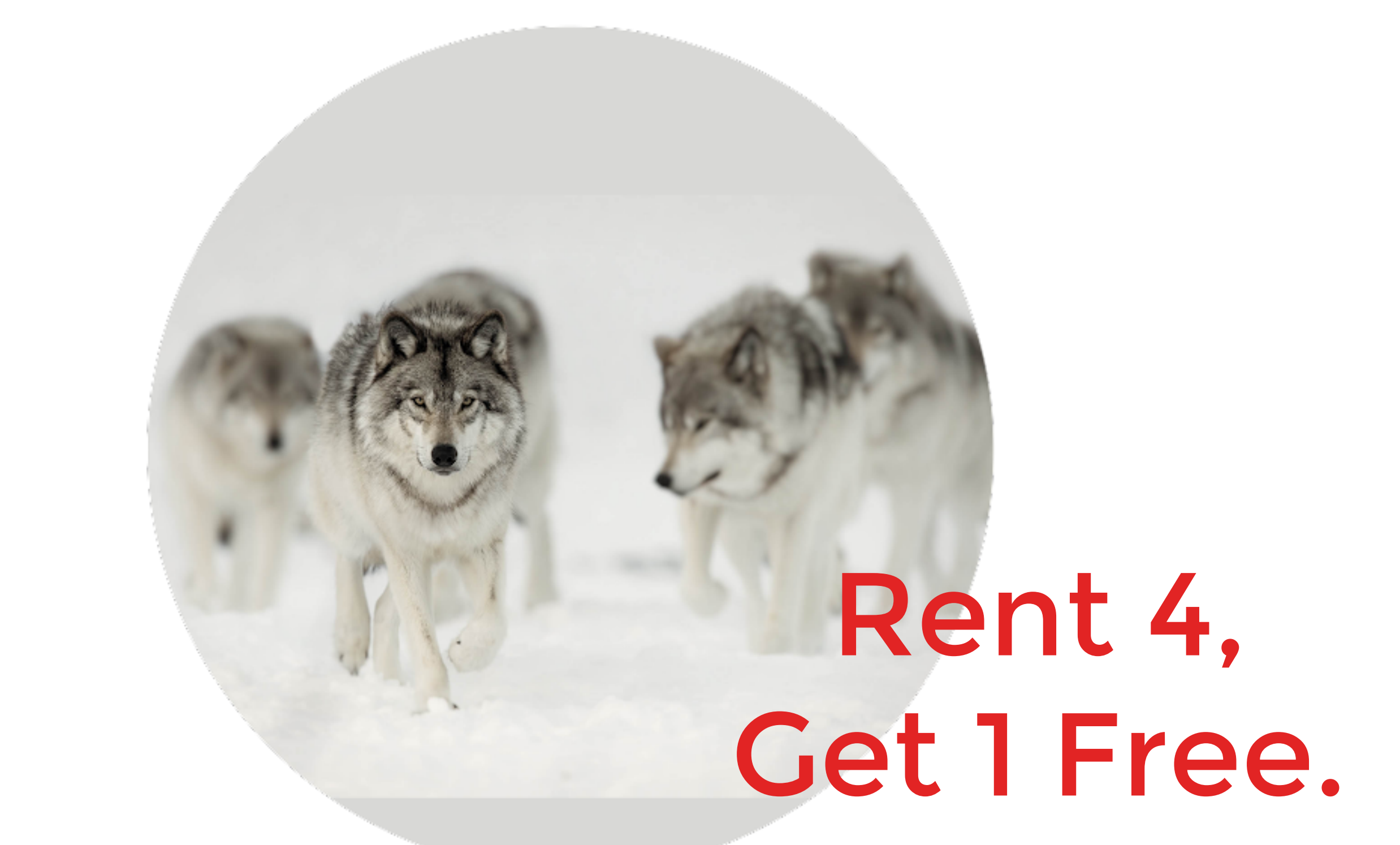
"Wolfpack" (Call for Details)