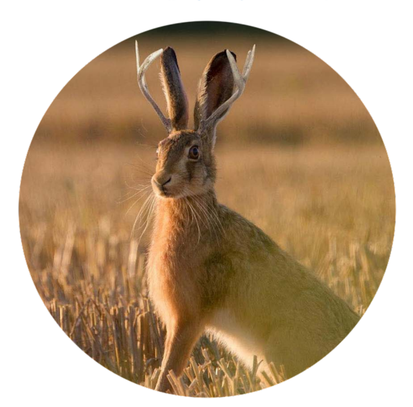
"Jackalope" $125/4 Hr.