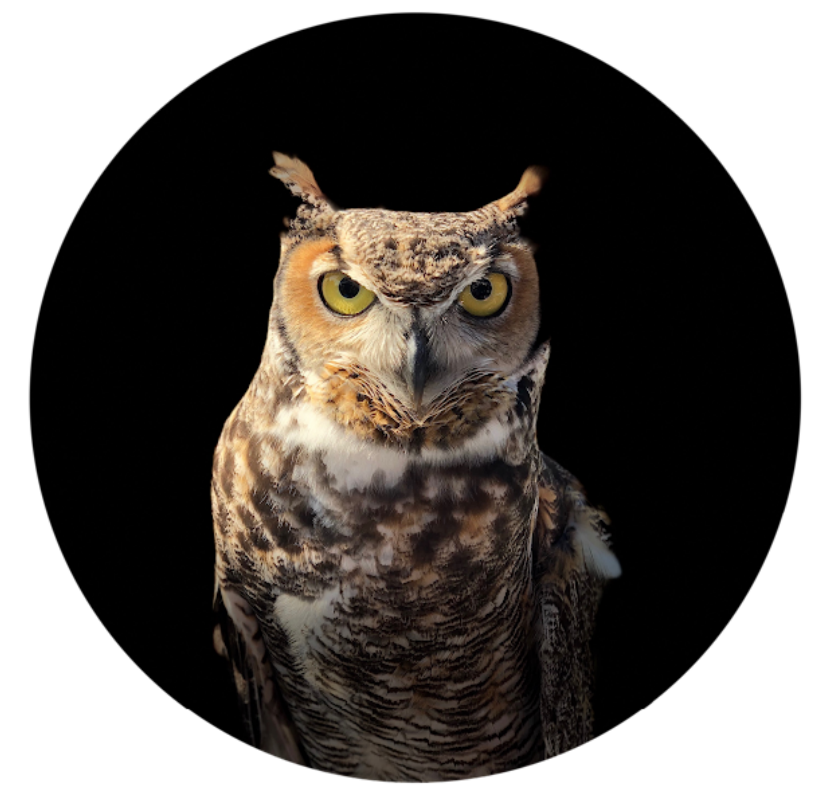
"Night Owl" $225/6pm-8am