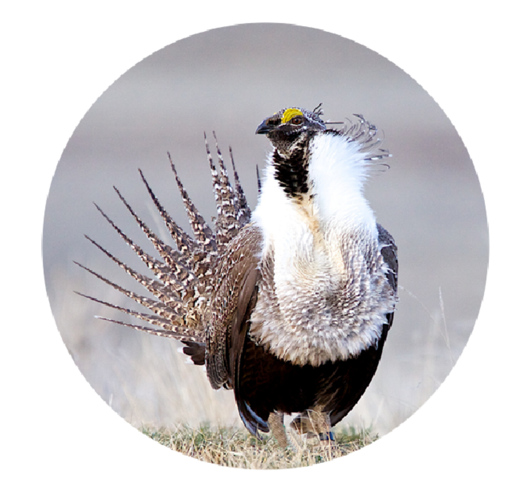
"Sage Grouse" $75/2 Hr.