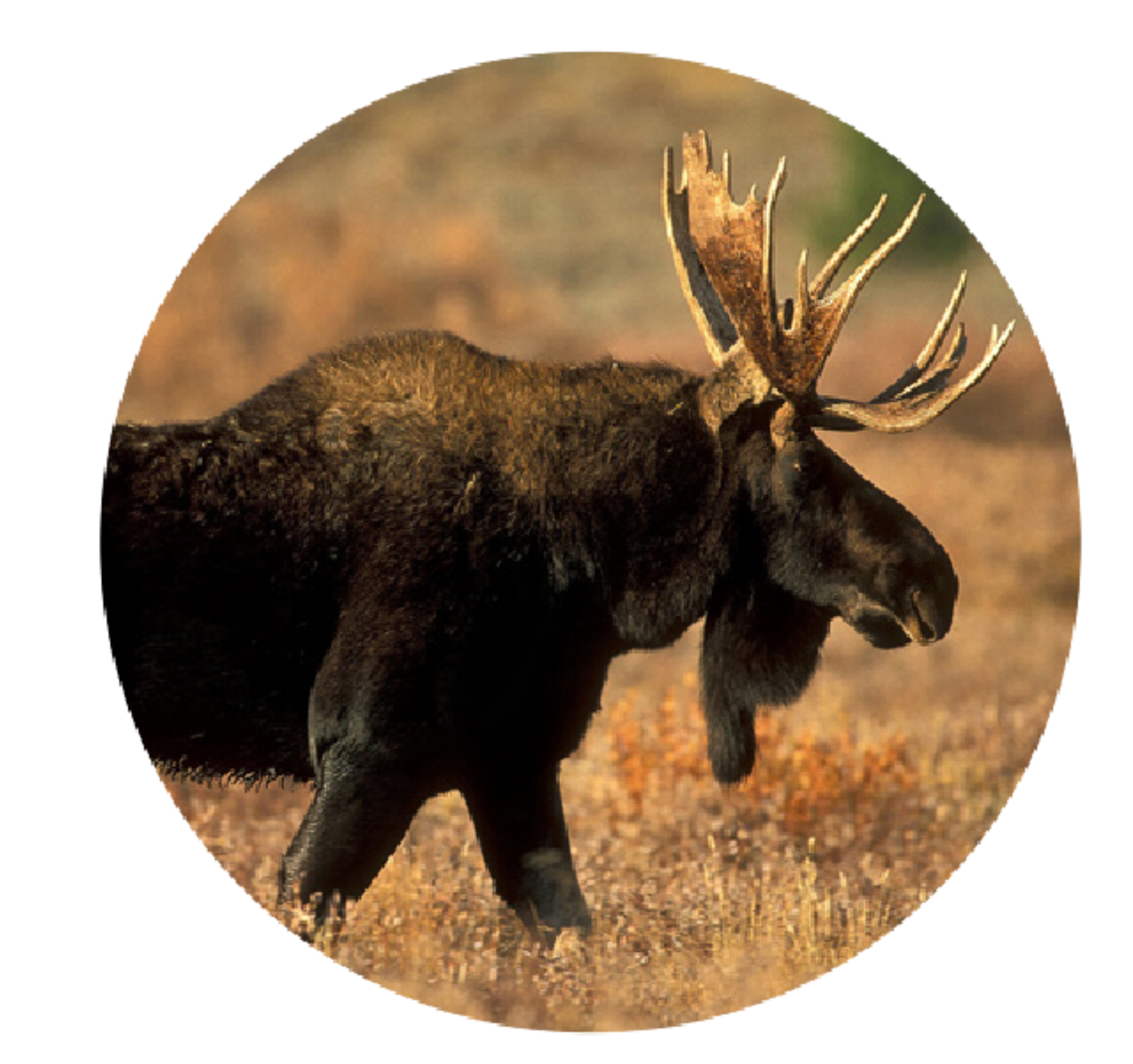
"Moose" $575/3 Days