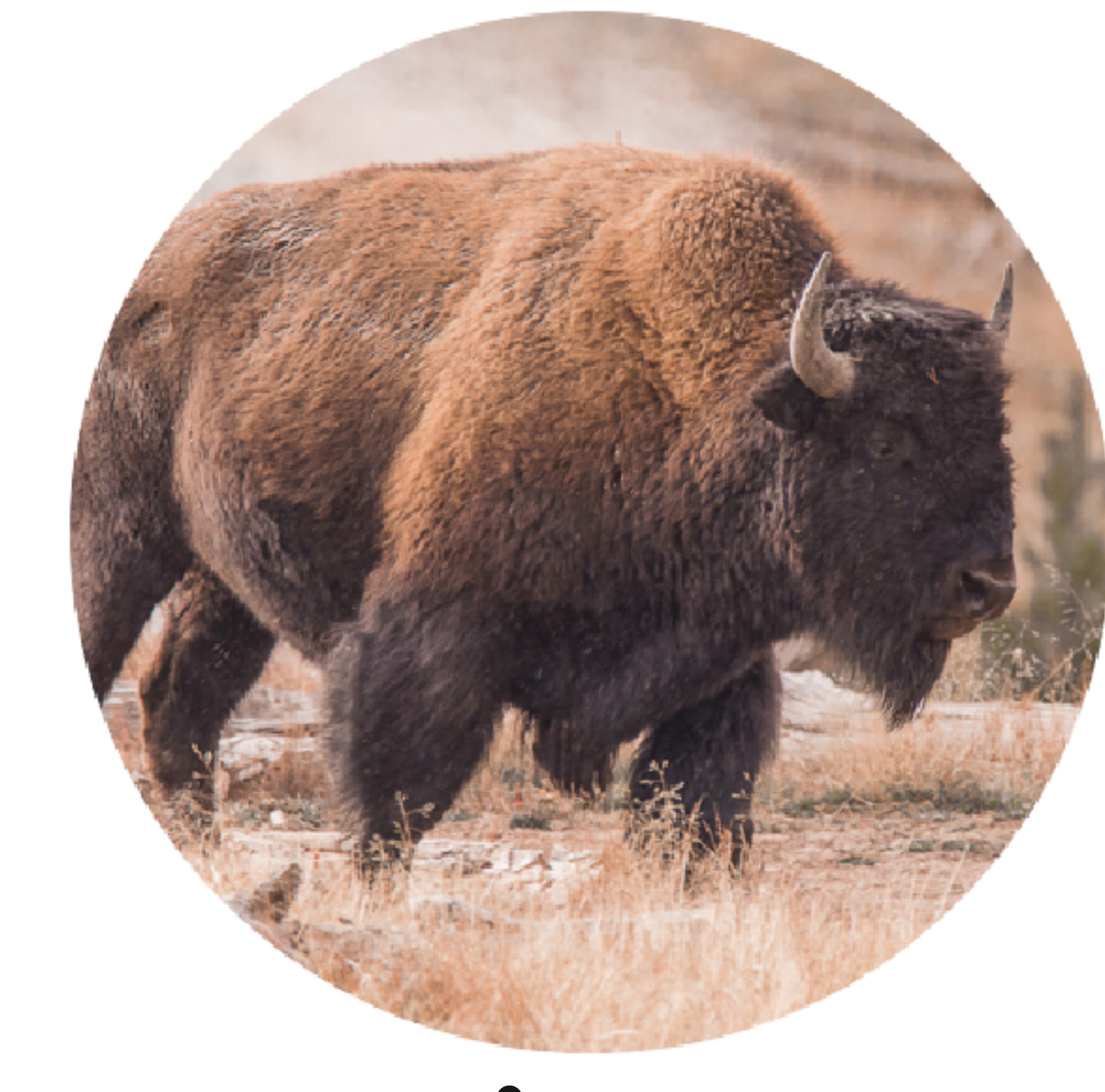
"Bison" $750/4 Days