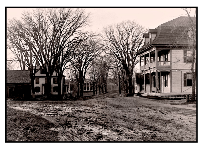
High mud season over 100 years ago: taking a right turn coming off the covered bridge onto River Road. The Quinnebasset Hotel is on the right (burned in 1902).