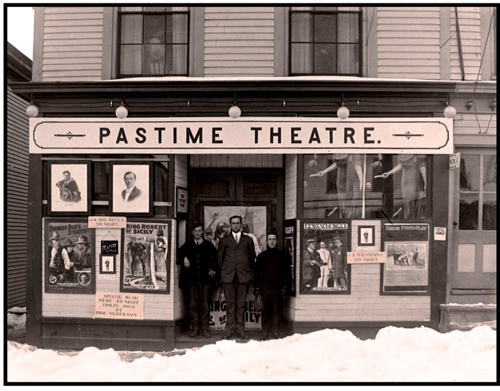
Back in the days when Norridgewock had a movie theater on Main Street (photo circa 1913, based on the movie poster in the window).