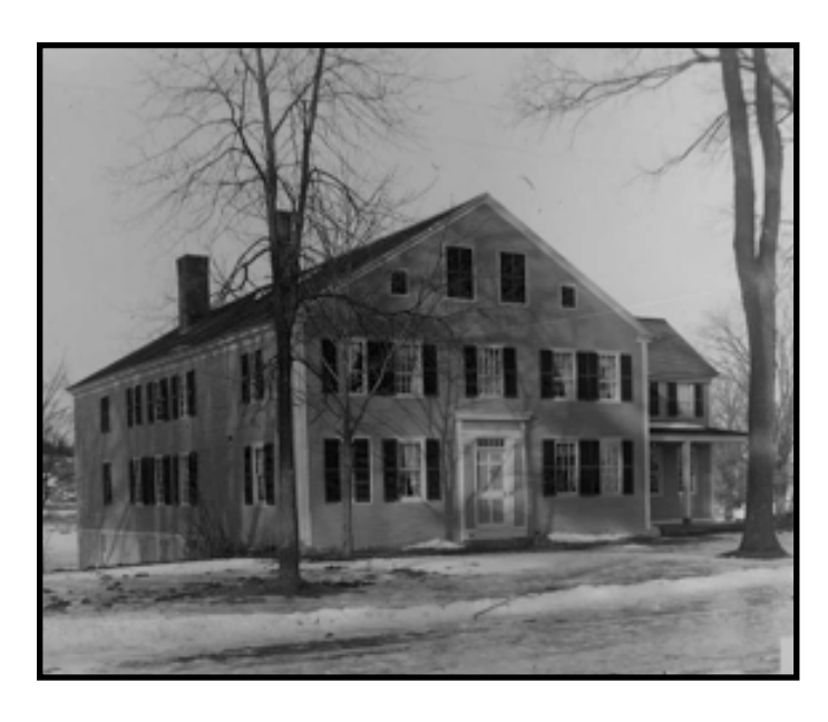
Danforth Tavern on River Road (above); the Court House, which was close by, is shown below.

Maine became a State on March 3, 1820. Twelve days earlier the SAS met and planned a procession to go from the Danforth Tavern down the road to the Court House, consisting of SAS officers, orator and chaplain, trustees, members, and finally any interested citizens.