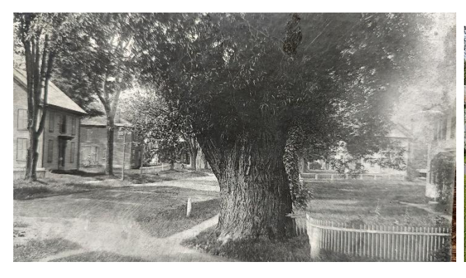
The Old Willow Tree