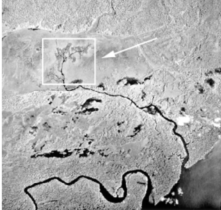
Figure 2 Rio Guariba (upper river), 1976. Infrared aerial photograph.

repeatedly driving water buffalo through the opening, encouraging the animals both to compact the soil by trampling and to graze the grass and sapling regrowth.