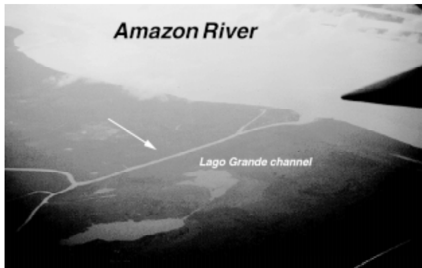
Figure 5 Lago Grande channel from the air, January 2000.

timber industry. BRUMASA operated through concession, contract purchase, and also by carrying out logging operations of their own. Using mechanical diggers and dredgers, they cut many kilometers of access channels in the municipality of Breves on Marajó, and they also encouraged similar activities on the parts of suppliers (Raffles 2002). One independent supplier on the Ilha de Gurupá, for example, opened a 3 km long, 2.5 m wide logging canal by hand in the mid 1980s. 10