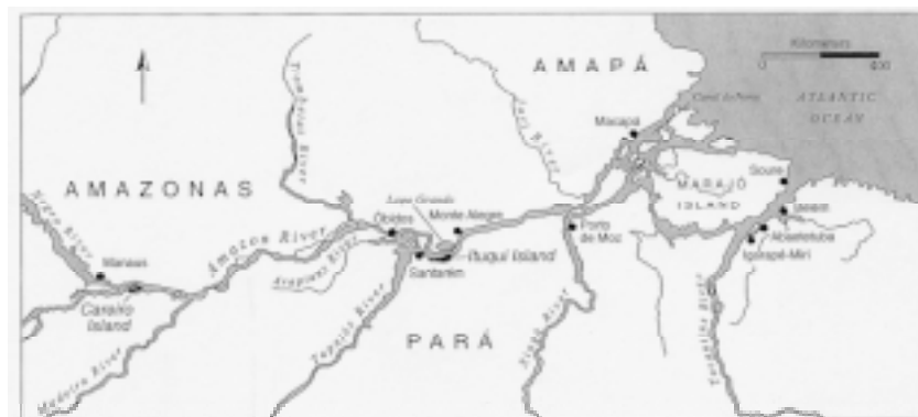
Figure 1 Map of Amazonia Indicating Locations Mentioned in the Text (Cartography by Ellen White, Michigan State University).