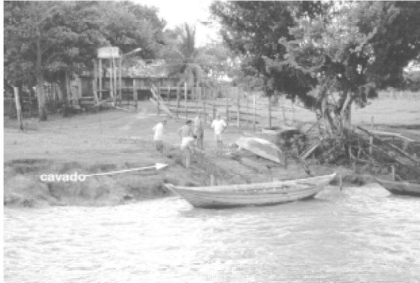
Figure 4 Men digging cavado on Ituqui Island, January 1996.

People on Ituqui utilize the process of slackwater sedimentation. Flood-waters slow down considerably in the slackwater environment found in the backswamp areas. The whitewater Amazon River carries heavy loads of Andean sediment that fall out of suspension as the flood-waters slow, filling in the area behind the levee over time (Sioli 1951). Researchers estimate that annual sediment deposition could be about 3 cm/day along the Amazon River, producing a potentially significant sedimentation of up to 2 m in any flood season (Mertes 1994; 171). Most of these sediments are fine grain silts important for the maintenance of soil fertility (Irion 1984).