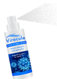
Figure – 1 ANOSMIC COVID-19 Smell Tester

ANOSMIC Covid-19 Smell Tester is a screening tool approved by Health Canada for early detection of COVID-19 infection for symptomatic and asymptomatic patients. The device gives off a particular odor derived from a specially engineered combination of all-natural organic ingredients. This product is 100 % plant based and does not contain any animal, poultry, dairy, nuts, chemicals, or CBD. To test for the loss of smell, spray a small amount on to wrist or a tissue and inhale vapor. If a distinct smell is not evident, then there is a good possibility of COVID-19 infection.