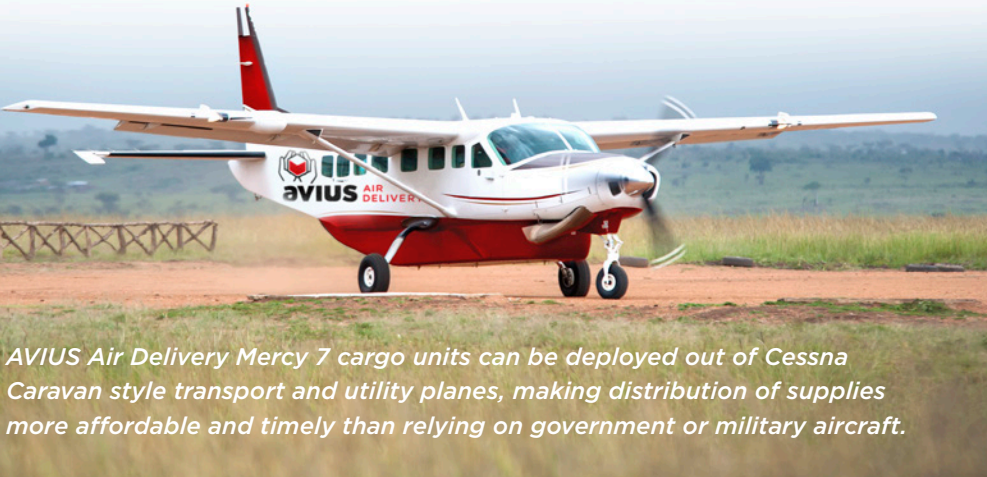
AVIUS Air Delivery Mercy 7 cargo units can be deployed out of Cessna Caravan style transport and utility planes, making distribution of supplies more affordable and timely than relying on government or military aircraft.

AVIUS Air Delivery provides an immediate response platform for 700 pounds of medicine, protective gear and re-hydration fluids anywhere in the world—and when the need is most crucial.