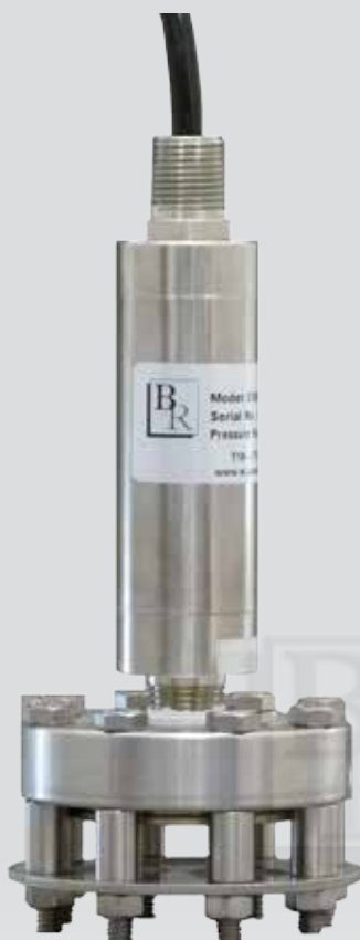
Model BC001 Birdcage®