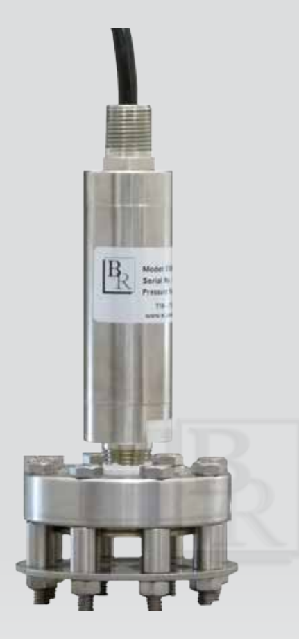
Model BC001 Birdcage®