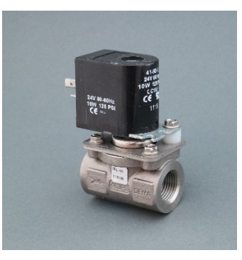
463PS & 464PS NC & NO | 3/8" & 1/2"