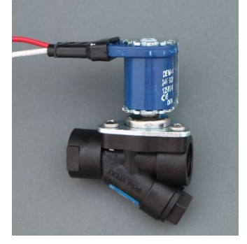
P442 & P443 NC & NO | 1/4" & 3/8"