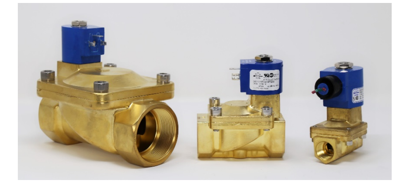
NS71 NC & NO | 3/8"-2" NPT