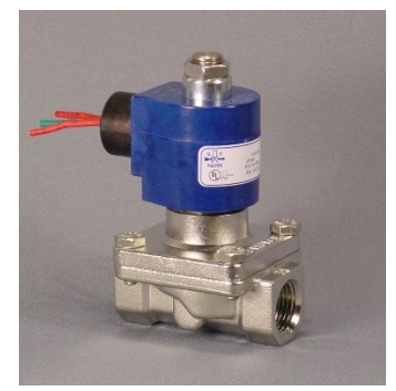
NS20 0 Pressure Differential NC 3/8"-1-1/2" | NO 3/8"-3/4"