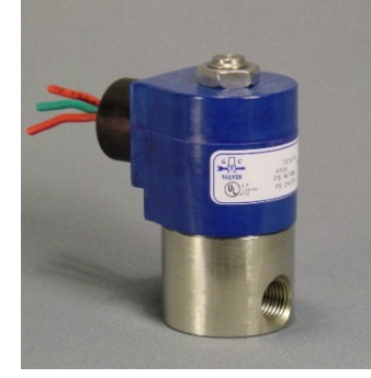
NS30 & NS31 NC & NO | 1/8", 1/4", 3/8"