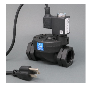
C4 NC & NO | 1/2" - 2"