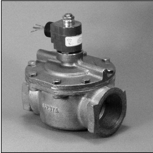
Brass, nickel plated brass and stainless steel bodies in 1", 1-1/4", 1-1/2" and 2" NPT anti-water hammer designs.

GC Valves manufactures slow closing valves from 3/8" to 2" NPT. These high performance brass and stainless steel bodies are designed to close in a controlled manner on water and similar liquids.