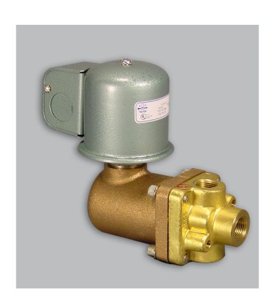
3-WAY OIL RECIRCULATING | K13 SERIES LEVER ACTING 3/8", 1/2", 3/4" NPT BRASS