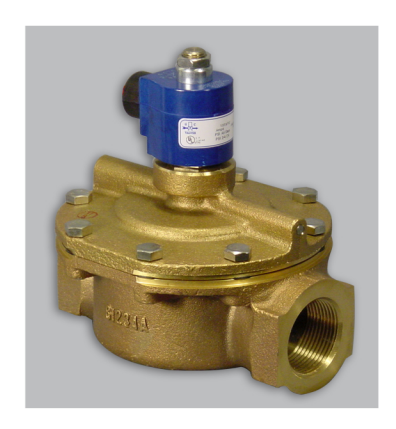
STEAM and ANTI-WATER HAMMER | HIGH PERFORMANCE 3/8" to 2" NPT STAINLESS STEEL | BRASS