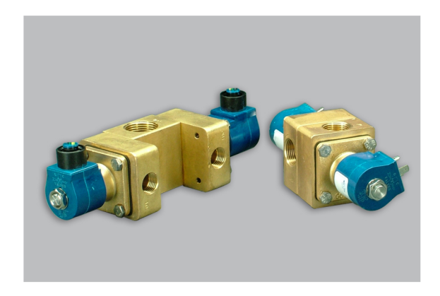
3-WAY HIGH FLOW | M20 M21 SERIES 3/8", 1/2", 3/4" NPT STAINLESS STEEL | BRASS | NORYL