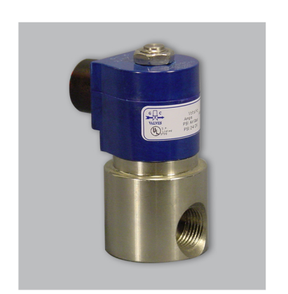
HIGH FLOW PILOTED PISTON | S40 SERIES 1/4", 3/8", 1/2" NPT STAINLESS STEEL | BRASS