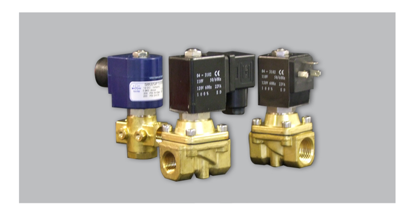
HIGH FLOW MINI-DIAPHRAGM | S80 SERIES 1/4", 3/8", 1/2" NPT BRASS