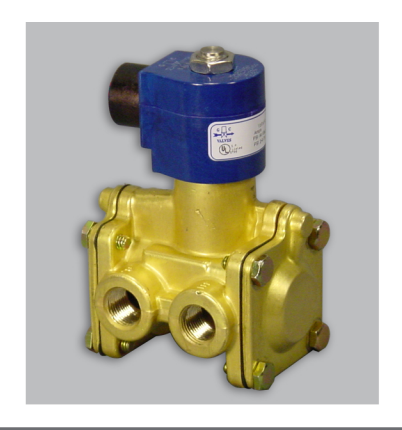
3-WAY PILOTED DIAPHRAGM | S20 SERIES 3/8", 1/2" NPT BRASS