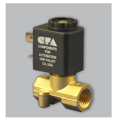
DIRECT ACTING | S30 S31 C4 C9 SERIES 1/8", 1/4", 3/8" NPT STAINLESS STEEL | BRASS | ALUMINUM | NORYL