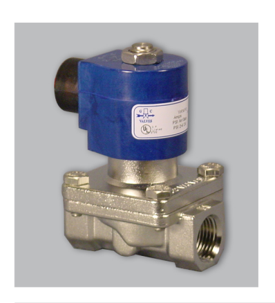
HIGH PRESSURE | H21 H40 H90 C4 SERIES 1/4" to 1" NPT UP TO 2200 PSI