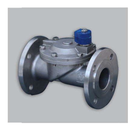
FLANGED | S21 SERIES 2" to 6" FLANGED PORTS STAINLESS STEEL | CAST IRON | CARBON STEEL